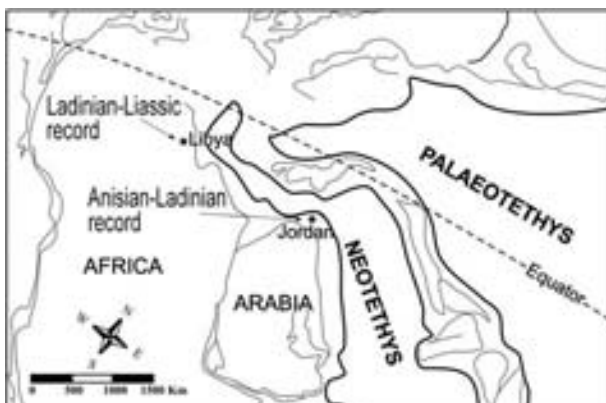
FIGURE 1 | Permo-Triassic palaeogeographic reconstruction of the Paleotethys and Neotethys at the northern Gondwana region (modified from Stampfli and Borel, 2002a).

The Neotethyan shoreline approached the western shoulder of Gondwana diachronously; during the middle