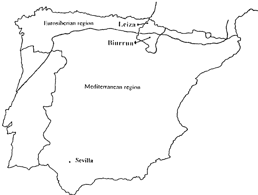
Fig. 1. Location in Navarra (Spain) of the studied woods.

the references to the sixteen permanent squares, we have named every one by four symbols, with the following meaning: L1, wood of Leiza, slow fire; L2, wood of Leiza, quick fire; B1, wood of Biurrun, quick fire; B2, wood of Biurrun, slow fire; S (in third position), higher; I, lower part of areas; S (in the last place), without addition of unburnt soil; C, with addition of unburnt soil.