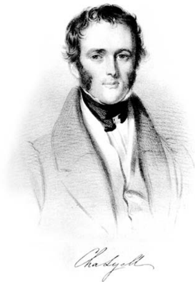
FIGURE 1 | Charles Lyell around 1836. Drawing by J.M. Wright. National Portrait Gallery, London, (Wilson 1972).

The major aim of Lyell's trips to Spain was the study of volcanic systems, although he also made other interest-