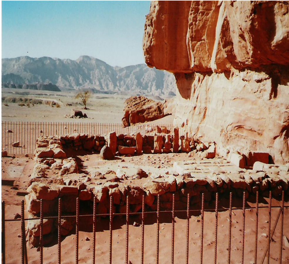
Fig. 4. Timna valley: Temple of Hathor (Site 200)