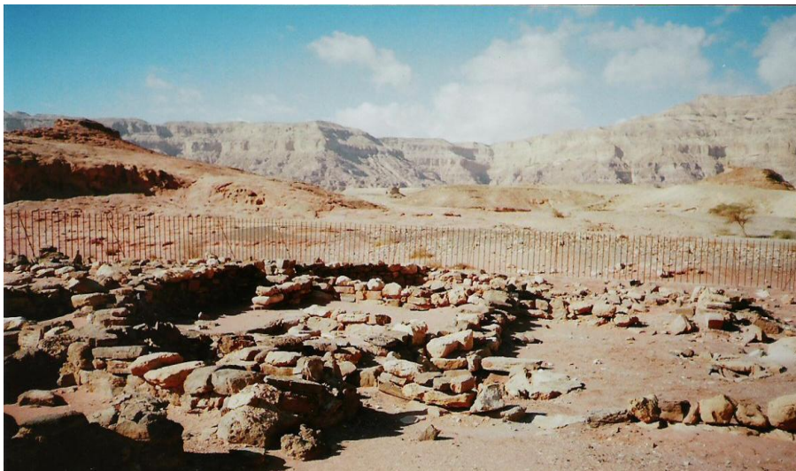
Fig. 3. Timna valley: Smelting Site 2