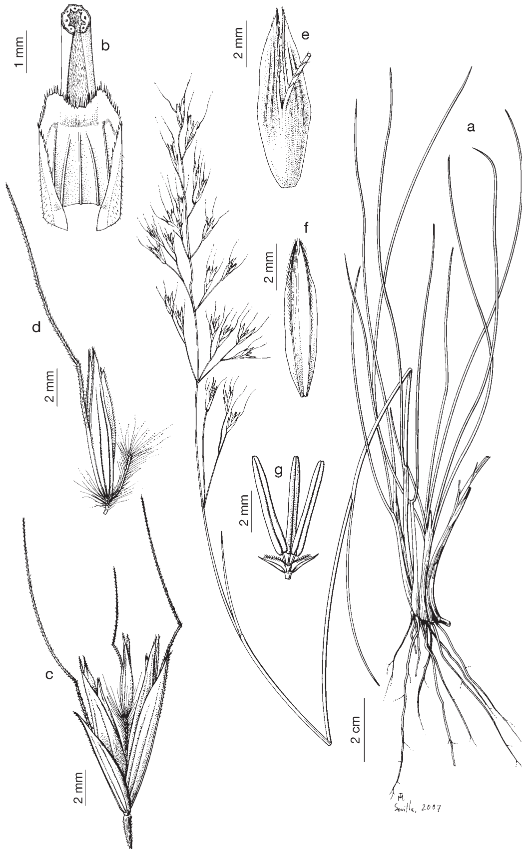
Fig. 3. Helictotrichon devesae (España, Toledo, La Puebla de Almoradiel, SEV 217062): a , habit; b , ligule of basal leaf; c , spikelet; d , dispersal unit in lateral view; e , lemma; f , palea; g , lodicules and fertile parts of floret.