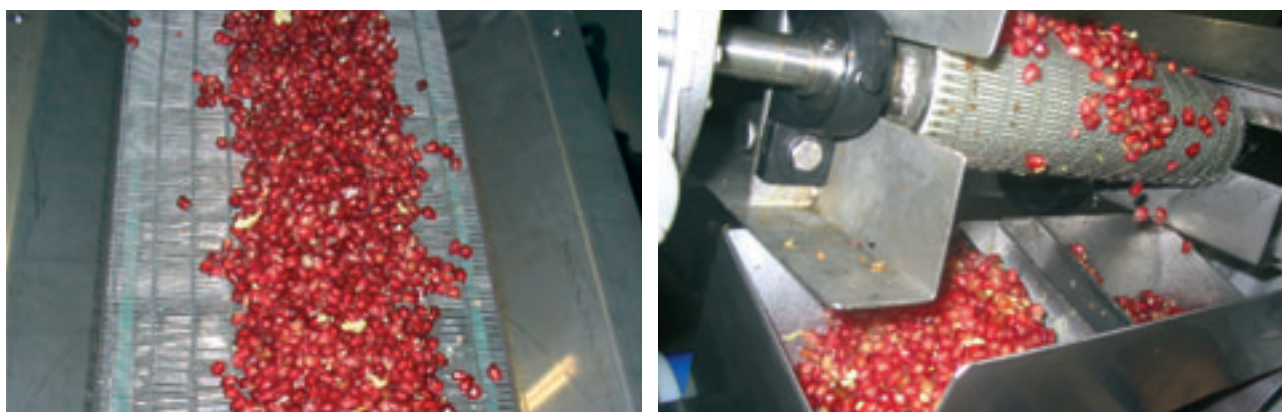
Figure 2. The arils get the prototype piled up in a single conveyor belt (left). Before entering the prototype the arils are split into four narrow bands (right).

consisted of three modules for singulating and transporting the arils under the cameras and separating them into user-defined categories.