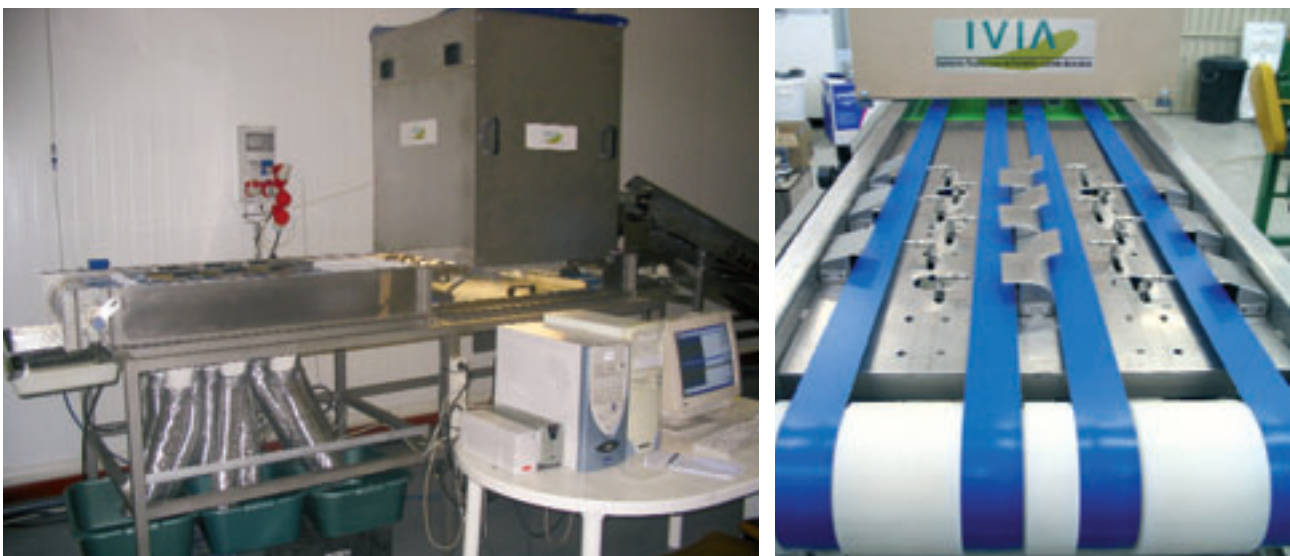
Figure 1. General picture of the prototype developed at the IVIA for the inspection of pomegranate arils (left). Grading area showing the air jets and the outlets at both sides of the conveyor belts (right).

A whole prototype for the inspection of pomegranate was designed and constructed (Fig. 1, left). The prototype