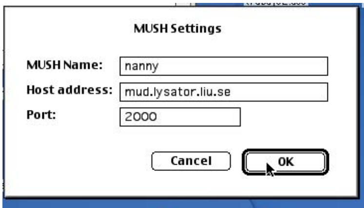
Figure 1: Connecting to NannyMUD.

To connect to this MUD with a client/program, we need to know: