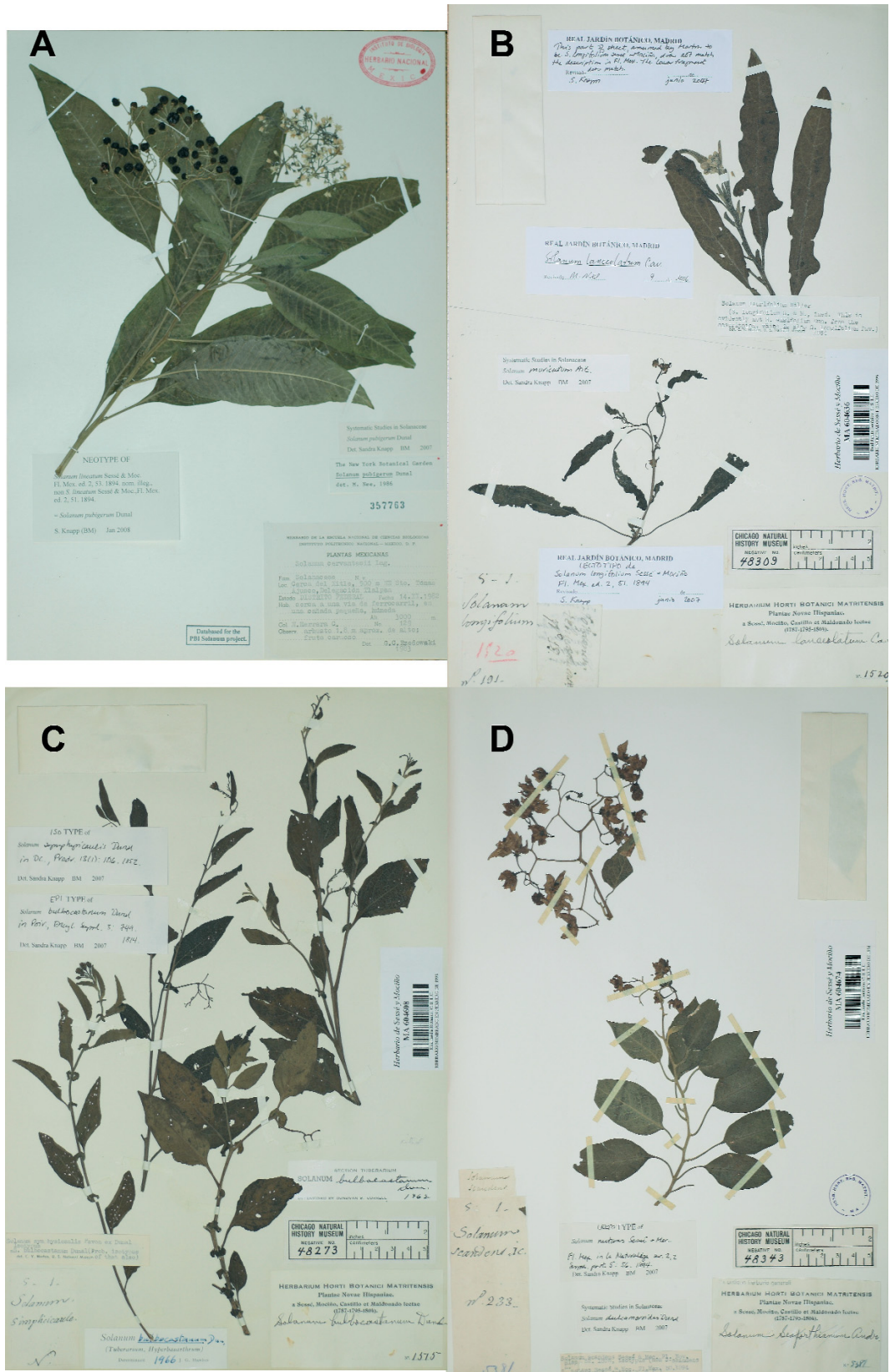
Fig. 3. A , neotype of Solanum lineatum Sessé & Moc. (= Solanum pubigerum Dunal) (Herrera C. 129, MEXU); B , lectotype of Solanum longifolium Sessé & Moc. (= Solanum muricatum Aiton) (MA 206020, lower left hand fragment); C , epitype of Solanum mexicanum Sessé & Moc. (= Solanum bulbocastanum Dunal) (MA 604608); D , neotype of Solanum nutans Sessé & Moc. (= Solanum dulcamaroides Dunal) (MA 604674).