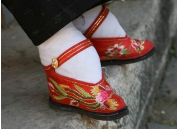
FIGURE 2. Wrapped feet with matched shoes.

The feet of a standing human have plate-like soles, rather than simple pivots. These plate-like soles are essential to stabilizing a standing posture. As an extreme counterexample (FIGURE 2) is the cruel three thousand years practice of foot wrapping of females in China until beginning of the 20th Century that made a woman totter while walking.