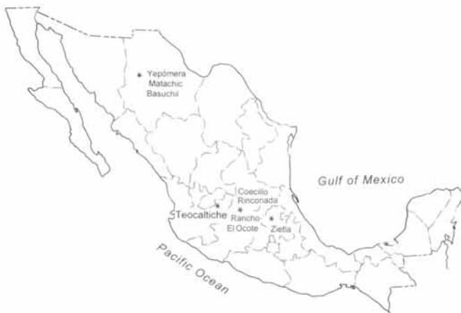
Figure 1. Location of Teocaltiche study area and the latest Hemphillian local faunas in Mexico.

cisive; IGM, Instituto de Geología, México; LACM, Los Angeles County Museum Natural History; MWSU Midwestern State University, Texas; m, meter; mm, millimeter; P, premolar; M, molar; Ma, million years ago; UCMP, University of California, Museum of Paleontology, Berkeley; w, width.