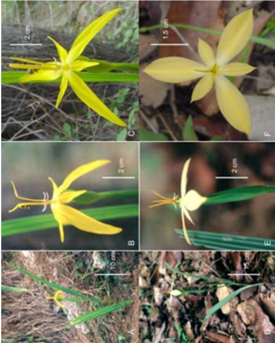
Fig. 1. A-C Colima tulitensis convoluta . A. habit; B. flower, lateral view; C. flower, frontal view; D-F Colima tulitensis tulitensis . D. habit; E. flower, lateral view; F. flower, frontal view.