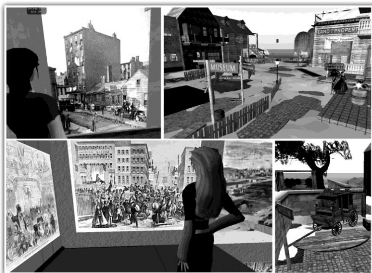
Figure 5. Five Points: representation of the movie set from the movie Gangs of New York in SL. (ELEGUA: 67, 159, 22)

were awaited to go to the army as soon as they set a foot in America: newcomers were recruited to go to the war while many rich Americans stayed at home. The participants will comment on the video by accessing a blog in the Moodle platform. As a closing activity, students will access and explore Five Points, the place where the movie occurs, in SL (ELEGUA: 67, 159, 22) to contact a virtual representation of the movie set (Figure 5).