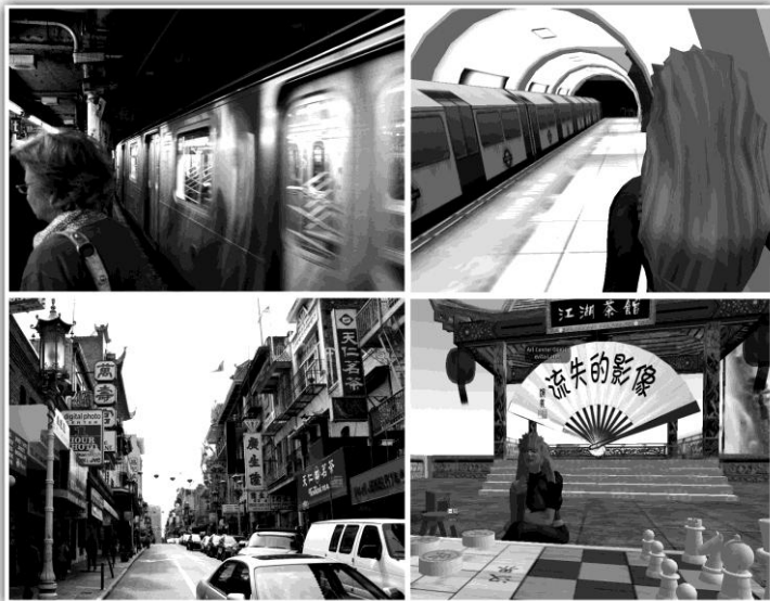
Figure 6. Subway and Chinatown: Real and virtual. Subway station (SECOND HEALTH TRAINING: 176, 185, 22); and Chinatown (SAMUEL LAND: 46, 44, 22).

The instructor will help participants by clarifying doubts and helping them create the Moodle quiz.