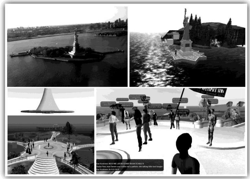
Figure 3. Statue of liberty: Real & Virtual. Welcome to Second Life (Help Island).

In SL, users arrive at the Help Island (Figure 3) in search of new identities, new adventures, and new personal and even professional opportunities. In this sense, the impact that the United States had on people in search of opportunities could be metaphorically compared to the impact that the Internet and, recently, SL has had on millions of people travelling virtually in search of newer identities and learning opportunities. A good understanding of these new virtual spaces may take us to define SL as the offspring of a New Virtual World. The development of new identities at this virtual land involves a number of changes and elections which remind to those transformations experienced by immigrants once they had set a foot on Ellis Island.