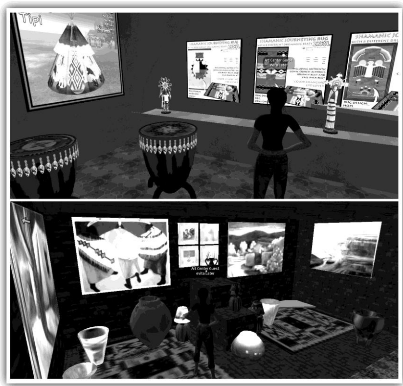
Figure 7. The Kiva – Indian Resource and Learning Centre (NATIVE LANDS: 28, 154, 23)

Part 2: The following step will be meeting at SL, at the Redskin shop (BERRY FRANCE CENTRE: 44, 146, 21). This meeting is extended to all groups and the language spoken will be English. The purpose is to analyse the topic of identity by visiting sites about Native American Indians, once they were the first US inhabitants and the true Native Americans, although they were always banished and marginalized in their country due to their culture and different ways of life. The purpose is to understand a little bit more about their culture, values, beliefs and ways of living. Next the group will go to The Kiva – Indian Resource and Learning Centre (NATIVE LANDS: 28, 154, 23) where there's an exhibition on Native Americans and their history (Figure 7).