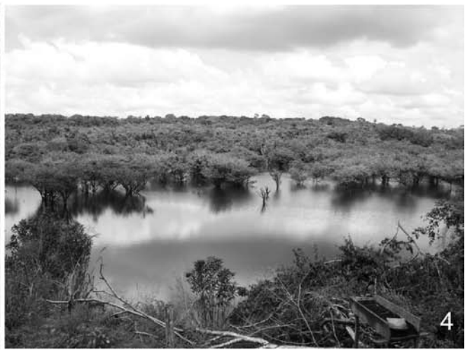
Figures 3-4. Trechalea amazonica F.O.P.-Cambridge, 1903: 3. Female carrying an eggsac. Figure 4. Area of sampling of Iripixi Lake, Oriximiná, Pará, Northern Brazil.

e Tecnologia (MCTP) of Pontifícia Universidade Católica do Rio Grande do Sul (PUCRS). The area was sampled from January 17 th to February 7 th in 2009 in Iripixi Lake, in the city of Oriximiná, state of Pará, Northern Brazil (Fig. 4).