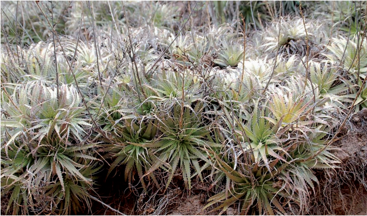
Fig. 23. A species of the bromeliad genus Puya showing the dead leaves that serve as a substrate for Perichaena calongei .

na (Fig. 23). It has proved to be an excellent substrate for myxomycetes as cultures of the leaf bases have been over 94% positive for myxomycete fruiting bodies or plasmodia. No other substrate, of the more than 100 moist chamber cultures, prepared with native plant remains from the same areas produced this species. It therefore appears to have microhabitat requirements found so far only in this plant genus.