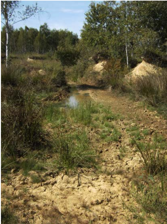
Fig. 2. Vauda Nature Reserve near Lombardore, typical habitat of Eleocharis pellucida and E. carniolica .