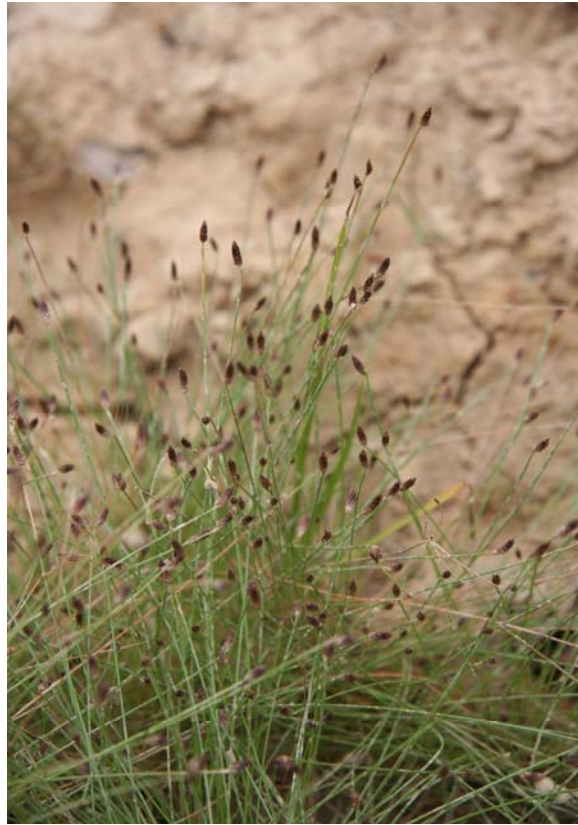
Fig. 3. Eleocharis pellucida (inflorescences and stems)