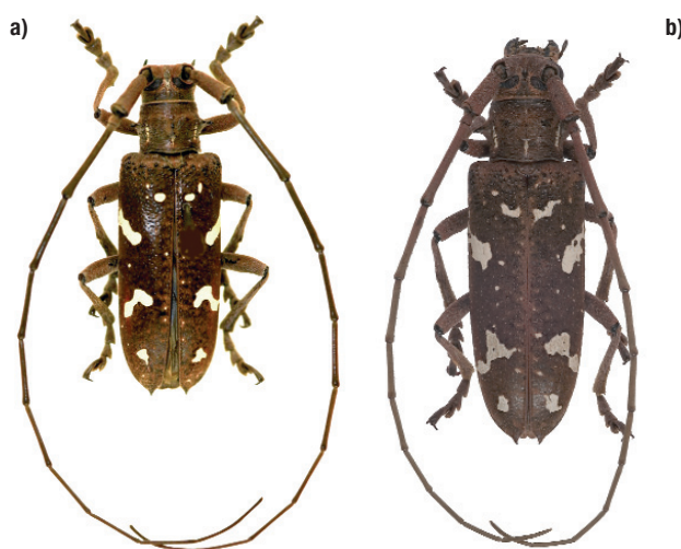
Figure 5. Plagiohammus spinipennis (Thomson, 1860): a) male, total length, 22.3 mm; 24-V-2003, Reserva Biológica Alberto Manuel Brenes, San Ramón (Costa Rica) (UV light trap), José Esteban col. (Colección José Esteban Durán INIA, Madrid); b) female, total length, 21.8 mm; 21-IV-2006, Reserva Biológica Alberto Manuel Brenes, San Ramón (field station incandescents lights), Hugo Pérez col. (Colección José Esteban Durán INIA, Madrid).

Eight examples collected, 18-24 mm in length. Long, slim subcylindrical body with subconvex elytra. Reddish brown in color, many parts of body covered