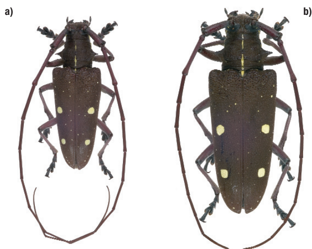
Figure 12. Taeniotes xanthostictus Bates, 1880: a) male total length, 35.9 mm; 21-V-2006; b) female total length, 32.1 mm; 4-V-2005, Reserva Biológica Alberto Manuel Brenes, San Ramón (field station incandescents lights), José Esteban Durán col. (Colección José Esteban Durán INIA, Madrid).

Comments: 141 specimens registered at the INBio, collected at a range of elevations from 1520 meters to sea level, most commonly from low ground. Recorded flight periods from February to December with the greatest frequency from April to September (INBio, 2008).