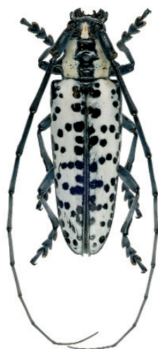
Figure 6. Deliathis nivea Bates, 1869, single example collected from Parque Braulio Carrillo, 11-V-2005, portable light trap, José Esteban Durán col. (Colección José Esteban Durán INIA, Madrid).

Length 31 mm. Unmistakable appearance. Shiny black overall tegument color with a very dense covering of pubescence on the pronotum and elytra except in specific spotted areas where the shiny black color is