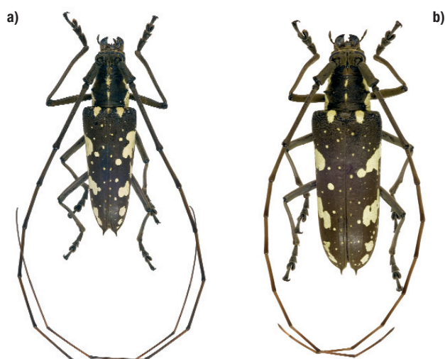
Figure 8. Neoptychodes cretatus (Bates, 1872): a) male total length, 38.2 mm; 2-V-2005, b) female total length, 31.2 mm; 24-V-2003. Reserva Biológica Alberto Manuel Brenes, San Ramón (field station incandescents lights), José Esteban Durán col. (Colección José Esteban Durán INIA, Madrid).

Recordings: a great number from January and February until December with the greatest frequency