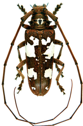
Figure 1. Plagiohammus albatus (Bates, 1880) male, total length, 25 mm; 1-V-2006. Reserva Biológica Alberto Manuel Brenes, San Ramón (light trap), José Esteban Durán col. (Colección José Esteban Durán INIA, Madrid).

with convex elytra, reddish brown in color speckled with fine conical blackish granulations more evident at the elytral base. Pronotum with spiny mid-lateral tubercles and with a small central hard patch amounting to a small black protuberance with a white patch in the center. Elytra with patches of almost pure white color spread in longitudinal lines that stand out against the reddish brown background. The ends of the elytra display a small dentiform expansion which does not amount to a real spine.