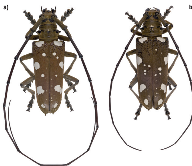
Figure 2. Plagiohammus elatus (Bates, 1872): a) male, total length, 31.2 mm; 22-IV-2006; b) female, total length, 38.9 mm; 23-IV-2006. Reserva Biológica Alberto Manuel Brenes, San Ramón (field station incandescent lights), José Esteban Durán col. (Colección José Esteban Durán INIA, Madrid).

Two examples collected, 31-38 mm in length. Long robust looking body, subcylindrical and covered by a fine pubescence, clear reddish brown in color. Pronotum with a small whitish patch in the middle and another on the upper basal part of each side tubercle. Scutellum covered by a short fine pilosity, yellowish gray in color. Elytra ending in a spine and each one with four white fairly big maculas at the base, on the side, on the oblique area and the fourth one, rather smaller, at the apex. Furthermore, the elytra are speckled with other small