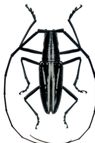
Figure 9. Ptychodes politus lecontei Thomson, 1856 male total length 23 mm; 13-VIII-2007. Reserva Biológica Alberto Manuel Brenes, San Ramón by hand (near of the Colonia Palmareña) Marco A. Zumbado col. (Colección José Esteban Durán INIA, Madrid).

Comment: 40 specimens recorded at the INBio, collected at elevations ranging from 1,200 to 700 meters, between 1990 and 1994. Collected from Liberia, Upala, Talamanca, Valle de la Estrella, Santa Cruz, Barra del Colorado, Turrialba, Pococí, Tortuguero and Barra Honda. Recorded flight period from February to