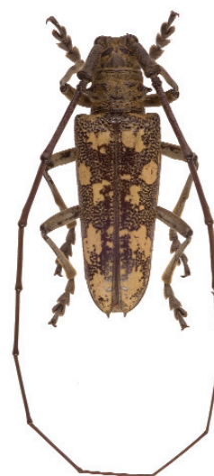
Figure 4. Plagiohammus rubefactus (Bates, 1870) male, total length, 31.2 mm; 18-II-2006, Reserva Biológica Alberto Manuel Brenes, San Ramón (field station incandescents lights), José Esteban Durán col. (Colección José Esteban Durán INIA, Madrid).

Comments: 12 specimens recorded at the INBio. These were collected between 1984 and 1993 in the following regions: Liberia, Monteverde, Turrialba, Braulio Carrillo, Talamanca, Coto Brus and Sarapiquí. The recorded period flight ranges from February to October (INBio, 2008).