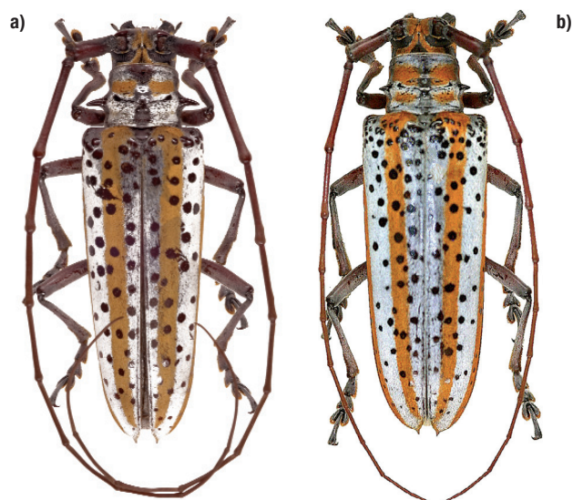
Figure 7. Deliathis quadritaeniator (White, 1846): a) male, total length, 38.2 mm; 22-IV-2006, «La Ventana», Reserva Biológica Alberto Manuel Brenes, San Ramón (Costa Rica) (portable light trap), Marco A. Zumbado col. (Colección José Esteban Durán INIA, Madrid); b) female, total length, 40.7 mm; 24-IV-2006, Reserva Biológica Alberto Manuel Brenes, San Ramón (light trap), José Esteban Durán col. (Colección José Esteban Durán INIA, Madrid).

Four examples collected, 34-40 mm in length. Long, subcylindrical, robust body. Convex elytra. Overall color dark reddish brown except for small circular areas covered with a fine and dense pubescence of a variety of colors: orangey and an almost white gray in longitudinal bands on the elytra. The tubercle process of the mesosternon is short and subconic.