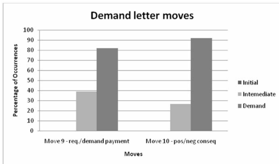
Figure 3. Demand letters most frequent moves

Finally, the moves in the letters of the Demand Stage that are overwhelmingly prominent are Move 9, Requesting or Demanding Payment, particularly when they demand payment, and Move 10, Stating Positive/Negative Consequences, in their negative consequence version. These moves reflect the strategy adopted by the letter writer at this stage of the process. The creditor has resorted to a simple “ if... then ” logic in an attempt to forcefully persuade the debtor to pay and satisfy the primary purpose of the collection letter.