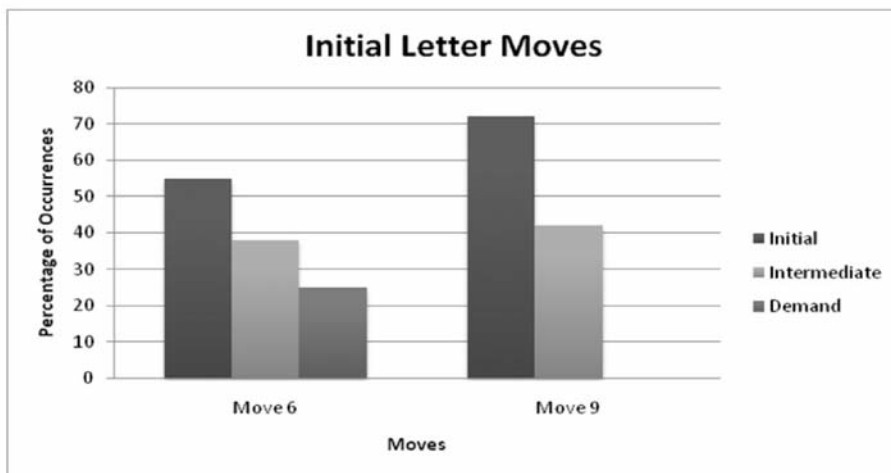
Figure 1. Initial letters most frequent moves

Moves most prevalent in the Initial Stage are Move 6, Identifying with the debtor, and Move 9, Requesting Payment. These moves correspond to what has been postulated as the gentler, more conciliatory letters whose purpose is to elicit payment but whose strategy is to remind the unfortunate or forgetful customer.