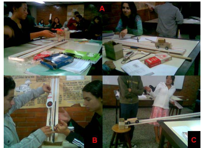
FIGURE 2. a. The laboratory Construction, b. taking measurements, c. Discussion.