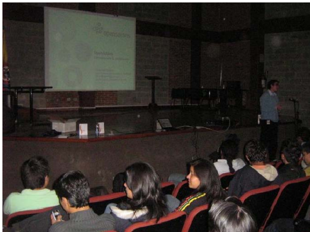
FIGURE 1. Students at the XIV technological weeks.

However, prospective students and technologists (some future engineers) have a more proactive in acquiring scientific knowledge, higher-level knowledge, knowledge that self-awareness, will be required for their careers and professional.