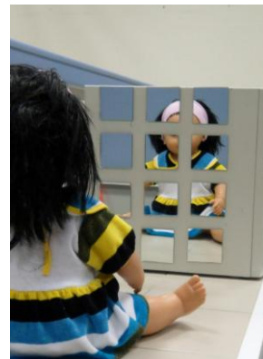
FIGURE 6. The mirror is cut into 12 equal pieces and arranged on a plane at a distance of 3 cm between each piece.

In the third activity, the plane mirror used in Activity 1 and another plane mirror of the same dimension are now divided into 12 equal pieces. In the first part of this activity, the mirrors are arranged on the plane at a distance of 3 cm between each piece (See Figure 6). In the second stage, the pieces of mirror are now arranged in three different geometrical shapes (See Figures 7, 8 and 9). There is no difference in the number of images in both situations; only one image can be seen.