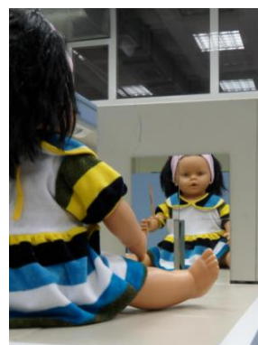
FIGURE 11. The image is seen when one of the 4 pieces of mirror brought forward about 5cm toward the doll, parallel to the other pieces.