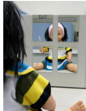
FIGURE 5. The space between the mirrors is increased to 3 cm each.