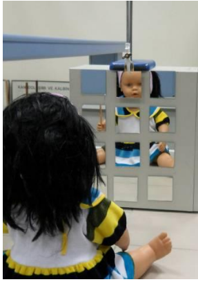
FIGURE 13. The image is seen when one of the 12 pieces of mirror brought forward about 5cm toward the doll, parallel to the other pieces.