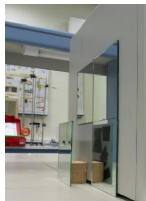
FIGURE 10. One of the 4 pieces of mirror brought forward about 5cm toward the doll, parallel to the other pieces.

Experiments on the nature of how multiple images form in a plane mirror other mirror pieces (See Figure 10, 11, 12 and 13). There is again no change in the number of images seen.