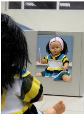
FIGURE 3. The mirror is cut into four equal pieces.