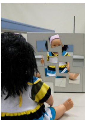
FIGURE 8. The pieces of mirror arranged in different geometrical shapes: geometrical shape 2.