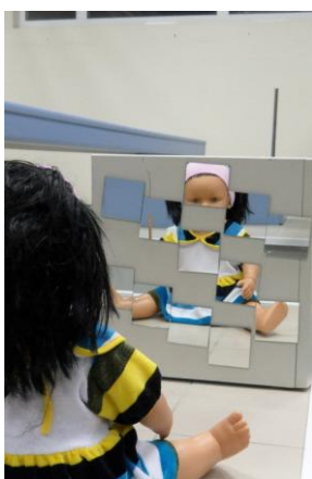
FIGURE 9. The pieces of mirror arranged in different geometrical shapes: geometrical shape 3.