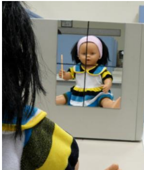
FIGURE 2. The mirror is divided into four equal pieces with a blackboard marker.