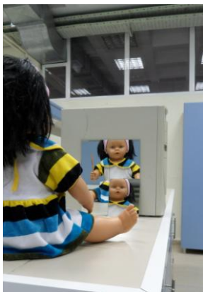
FIGURE 15. The number of images when a piece of the mirror is set up at an angle to the others.