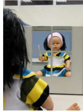
FIGURE 4. The pieces of the mirror are arranged on a plane, each 1cm apart from each other.