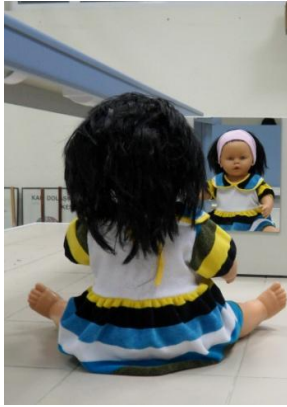
FIGURE 1. The image of a doll placed in front of a mirror.

pieces (See Figure 3) and in the third; these pieces are arranged on a plane, each 1 cm apart from each other (See Figure 4). In the fourth stage of the activity, the space between the mirrors is increased to 3 cm each (See Figure 5). There is only one image in the plane mirror in each of these stages. Dividing the mirror into 4 equal parts and changing the distance between the parts has not made a difference in the number of images seen.