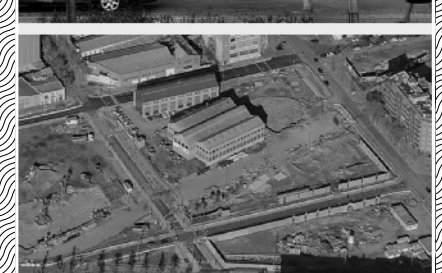
03 EVOLUTION OF THE OLIVA-ARTÈS FACTORY SITE