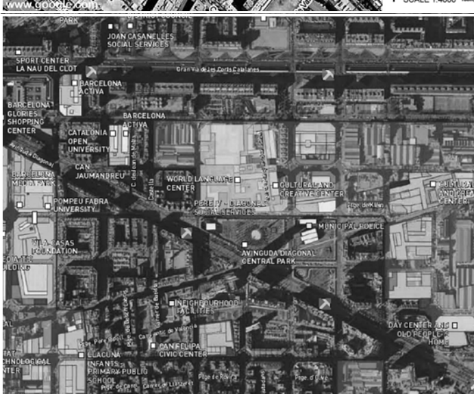
02 CENTRAL PARK POBLENOU SITE PLANS. BEFORE AND AFTER