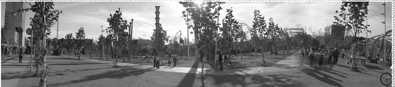
01 ACTUAL PARC OF POBLENOU