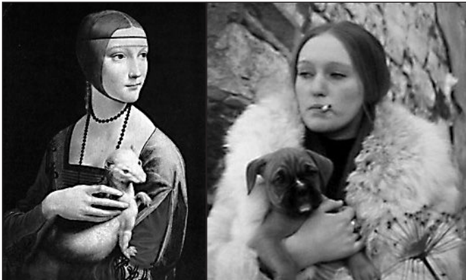
Picture 5. Lady with an Ermine versus mother with a dog.

At that the list of art quotations is exhausted, however, the technique of association continues in visualisations, when an actual art-work is left out of the film but revived in the filmed images in actions, positions, gestures and postures of personages. Thus, the case of Ginevra Benci and regularity of Leonardo's images may hint a similarity in Solaris between the actual female film image, Kris' mother, and a passive latent portrait of the Lady with an Ermine by Leonardo, never really shown in the film.