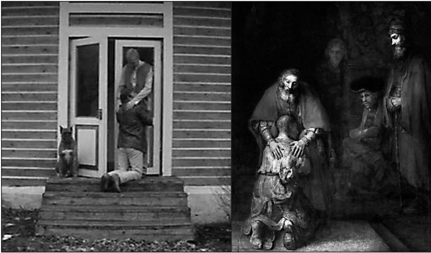
Picture 8. Return home in Solaris and Rembrandt's Prodigal Son .

Also the last episode of Solaris includes a speechless symbolical (with the only electronic sound representing Solaris ) acting after the fourth time of Bach's quotation. Kris returns home and meets his father at the porch; they are approaching slowly and synchronously in rhythm till they stand still in the symbolical postures of Rembrandt's The Return of Prodigal Son .