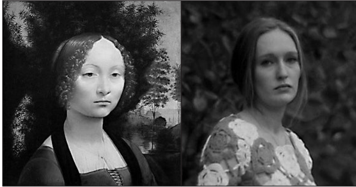
Picture 6. Resemblance between Ginevra Benci and Mother from Solaris .

The mother's gaze goes beyond the world, and her face does not tell her personality. Neutral countenance, aristocratic estranged blank look with tiredness and melancholy in it, lack of smile, eye expression without a touch of warmth: all those conflicts with the mother's archetype. She appears a cold, contemplative lady, a being of a dual nature, enigma of the film, remained nameless. Her image, her pose, manners, hair-style, clothing, and a little animal make her a double of the Lady . Besides, in this representation the mother's image is close to Ginevra Benci.