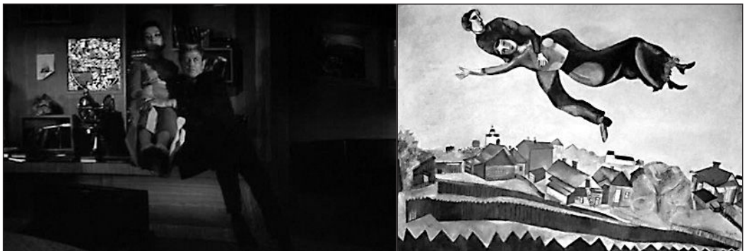
Picture 7. Episode of weightlessness and Chagall's Au Dessus de la Ville .

Giving more examples turns a haphazard fact of visualisation to a systematic technique. In the episode of weightlessness from Solaris , devoted to Bach's Prelude 33 , there comes an on-screen visualization of Marc Chagall's soaring lovers, including some typical details of candle light.