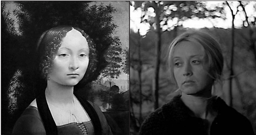
Picture 2. Ginevra Benci and Maria from The Mirror .

“The face of the woman painted by Leonardo is animated by an exalted idea and at the same time might appear perfidious and subject to base passions. It is possible for us to see any number of things in the portrait, and as we try to grasp its essence we shall wander through unending labyrinths and never find the way out. We shall derive deep pleasure from the realization that we cannot exhaust it, or see to the end of it. [...] It is not possible to catch the moment at which the positive goes over into its opposite, or when the negative starts moving towards the positive” 32 .