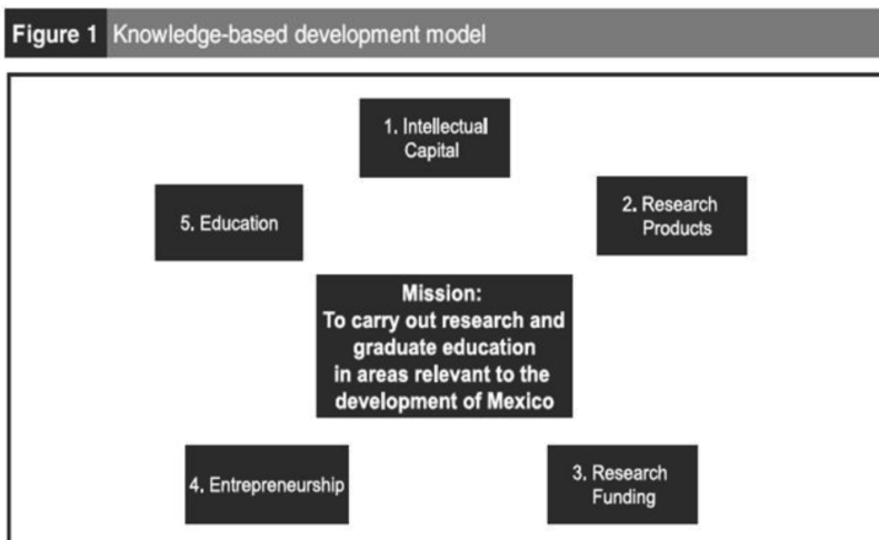
FIGURE 1: Development model based on knowledge (Cantú, Bustani, Molina, and Moreira, 2009)

Chairs are research groups supported by a capital provided by the institution, and to carry out their research projects, chairs complement this capital with external resources obtained from companies, consultancies, research projects organized by national and international public bodies. Figure 1 shows the organization model of chairs for knowledge production.