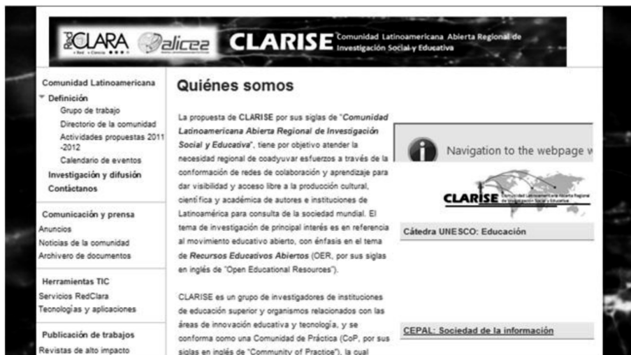
FIGURE 3 : CLARISE Portal (Web page https://sites.google.com/site/redclarise/ )