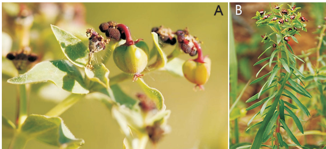
Fig. 2. E. guaraniorum : A , detail of the inflorescence. The whitish pubescence shown here is not part of the plant, but some kind of insect or spider silk; B , habit.

(PY). Misiones: Isla Yacyretá, pista hacia las dunas de San Miguel, 27°27.343' S, 56°48.284' W, 28-X-2010, A. Bogado, M. Quintana & J. Molero 42103 (BCN, MA, PY); Isla Yacyretá, duna de San Rafael, camino del vertedero de Añacua, 27°24.688' S, 56°41.708' W, 90 m, 28-X-2010, A. Bogado, M. Quintana & J. Molero 42106 (BCN, MA, PY).