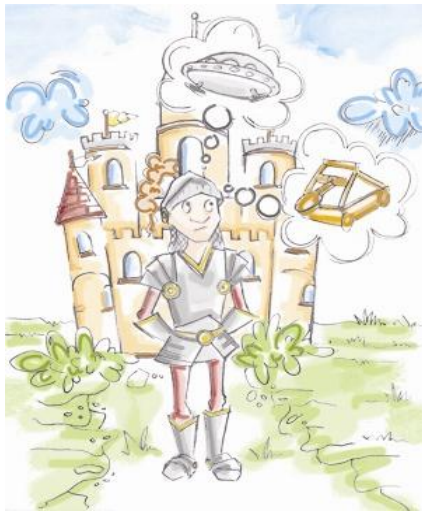
Figure 3. Extreme Process