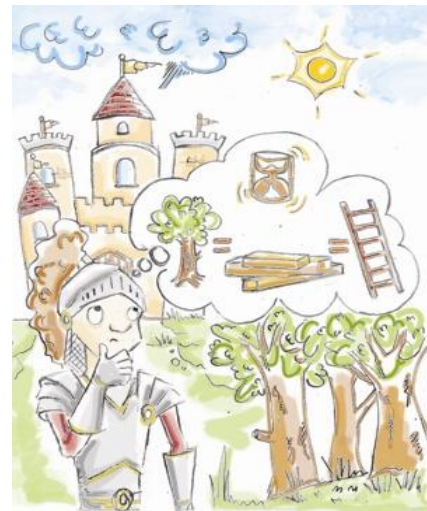
Figure 8. Process without rhythm

A software development process should try to keep a sort of rhythm in each of its activities so that there are no gaps that hinder efforts and resource investment from efficiently contributing to constituent-workflow tasks. It is common to find elongated-time activities, while other activities are time-constrained, the proportions of time allocation must be fair without causing trauma. The time resource should be one of the main variables to govern the processes, the workflow must balance the periods of time employed in each activity, thus avoiding botched executions. A process without rhythm occurs when other antipatterns are inserted, such as paralysis of analysis or design by committee [1]. In these harmful practices, it is evident that the imbalance in a specific activity impedes the normal execution of the remaining activities (Figure 8).