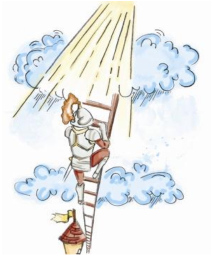
Figure 1. Top Process