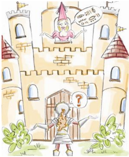
Figure 12. Process without Communication