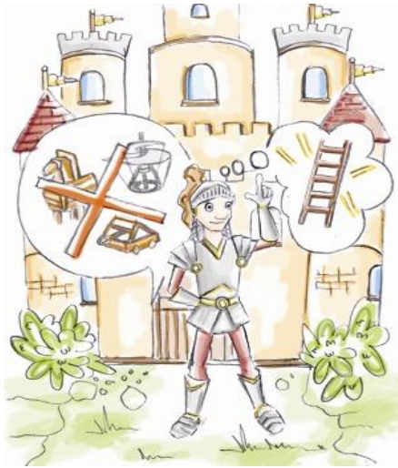
Figure 6. Immutable Process

of seeking new knowledge when developing the process, losing the possibility of improving the process (Figure 6).