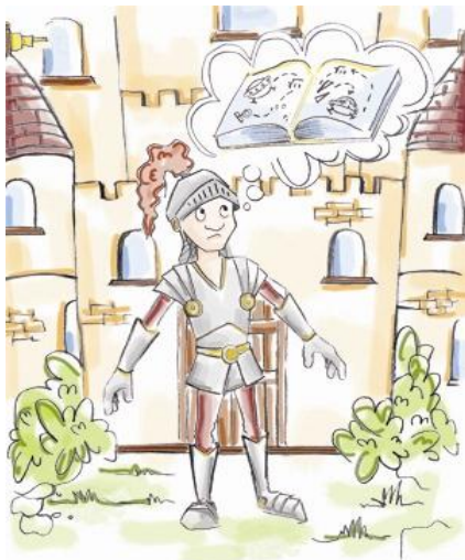
Figure 7. Process without evidence

Usually, software development processes involve creating documents related to the product being made, such as developing manuals and user manuals, among others. However, a document of the process itself, which at least provides information about what was learned from the process execution, is a task that is never performed. When the process lacks evidence of its execution, it is highly probable that the same actions will be re-executed with the same fundamental flaws. These side effects result in process delays, repeating and perpetuating defects. Processes without evidence, are a sign that there is no process manager, who leads the process and records its past history for new process implementations (Figure 7).