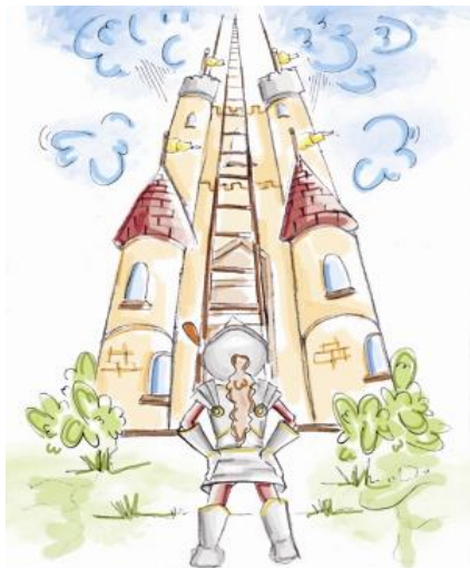
Figure 10. Perpetual Process

When a process becomes interminable is said to be a perpetual process . Generally speaking, the process falls into infinite loops when the workflow is repeated without generating useful products. This type of process is evidence of the immaturity associated to the organization that runs the process as well as of its lack of adequate estimation, its failure to meet the requirements and development. Such immaturity is most obvious when in the testing phase, where developers will need to constantly repair things, with the aggravating circumstance that these repairs might cause further inconveniences. In the perpetuity of the process there is no proper configuration management, and quality control is summarized in trying to fix an accumulation of defects that cause poor reliability [10] of the results obtained at a particular point of development. When a process becomes perpetual, it usually ends abruptly with negative collateral implications for the participants (Figure 10).