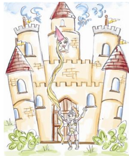
Figure 5. Slide Process

Adopting a process that encourages the production of outputs from a given input regardless of the way in which workflow occurs is generally counterproductive. Software processes should not be slides, which do not pay interest to the way results are obtained, since in the workflow participate a society of roles that may be sacrificing not only the quality in the process, but most importantly, sacrificing performance conditions and quality of life. In a slide process, it is typical to start at a certain speed and finish with acceleration. In the same way, a process without rhythm [2] starts with extended times in its initial phases and have tight schedules in development and deployment phases. A slide process does not control time, delaying projects; it also accelerates at critical stages, sacrificing product quality. These processes end up adjusting schedules, paying fines, conducting renegotiations, and making considerable losses for the organization (Figure 5).