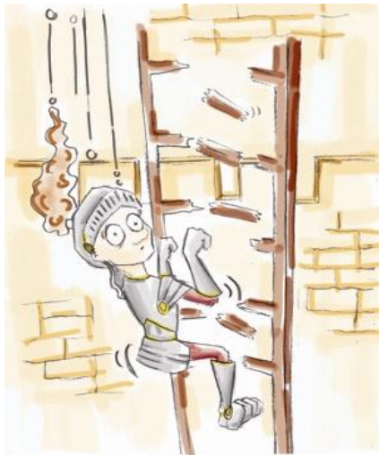
Figure 9. Domino Process