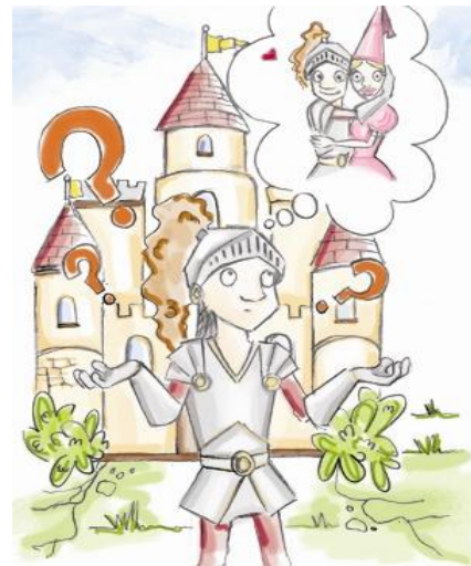
Figure 11. Headless Process

Poorly managed processes, and /or processes with leadership problems in the various disciplines, are referred to as headless processes. This type of process does not define clear functional objectives and responsibilities, there is a poor identification and assessment of the roles and therefore there is no adequate assessment of the disciplines; activities usually focus on the production of code without ensuring appropriate quality conditions; moreover, ad-hoc delegations occur. Headless processes exhibit exaggerated rotation of staff, stalling the workflow and leading to an abrupt end with unfavorable implications for the parties involved (Figure 11).