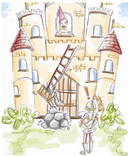
Figure 4. Casual Process

Conducting a software process often becomes an ad hoc activity, resulting in improvisation of the tasks. Such type of work takes place when an organization is not aware of the importance of processes and usually ends up diverting all the workload onto development activities. Ad hoc processes arise primarily because there is not a process manager who guides the selection of at least one process to perform. Ad hoc processes are not aware of the roles and end up creating handyman roles, promoting anti-patterns that generally resemble the project management anti-patterns [1]. An ad hoc process ends up extending schedules, repeating efforts and consuming resources. Because the process is not clearly identified, it may end up taking different names from a list given by the participants, which is usually inconsistent. A casual process tends to be confused with an organization's customized process, therefore, care must be taken when the course of the process has features like those listed above. (Figure 4)