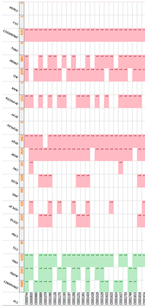
Figure 2: Overlap among sources and representation in targets