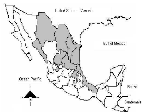
Figure 8. Map of Mexico showing the distribution of Triatoma gerstaeckeri in the states of Chihuahua, Coahuila, Hidalgo, Nuevo Leon, San Luis Potosí, Sinaloa, Tamaulipas, Veracruz and Zacatecas.

Wygodzinsky 1979, Zárata & Zárata 1985, Martínez-Ibarra et al 1992, Galaviz et al 1992), (Figure 8). The female measures 24 to 28.5 mm and the male 23 to 26 mm (Lent & Wygodzinsky 1979). In Chihuahua, T. gerstaeckeri has been collected between 940 to 1.380 masl, 27 adult specimens were captured in the peridomicile in a research conducted in three counties, three insects were positive to T. cruzi infection (11.1%) (Díaz et al 2007).