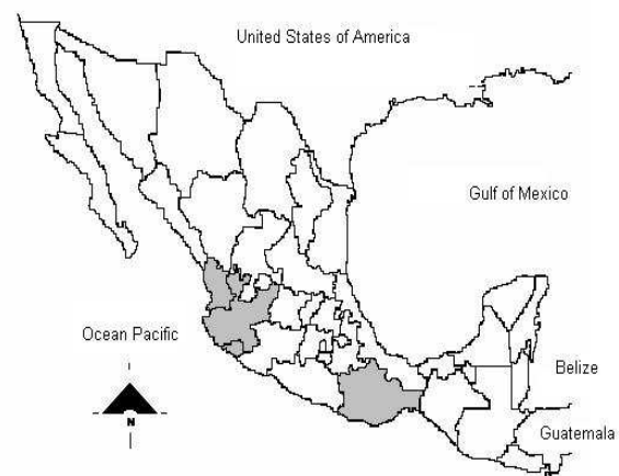
Figure 7. Meccus picturatus distribution in the states of Colima, Jalisco, Nayarit and Oaxaca, Mexico.

In two studies performed in 2000 and 2002, this species was not detected in any of the counties of the states of Nayarit and Oaxaca (Ramsey et al 2000, Martínez-Ibarra 2006). However, Magallon et al (2001) in Carrillo Puerto, Compostela County, in the state of Nayarit, reports the capture of M. picturatus , two specimens were in the domestic area, both negative to T. cruzi infection, 23 insects in the peridomicile with 10 positive insects to T. cruzi , and 28 in the sylvatic area, with 10 positive insects to T. cruzi .