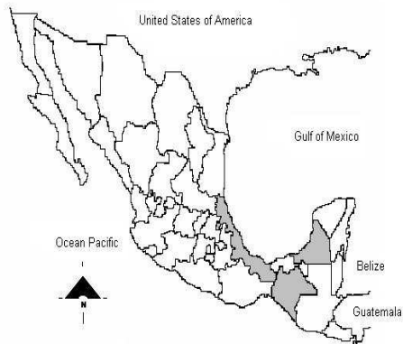
Figure 12. Map of Mexico showing the presence of Panstrongylus rufotuberculatus in the states of Campeche, Chiapas, and Veracruz.

In the wild areas in the south of Veracruz, some adults have been collected in the biological station of the Tuxtla region, and in the state of Chiapas in Bonampak (Vidal et al 2000, Zárate & Zárate 1985) reports it associated to housing (one specimen), this specimen was negative to T. cruzi infection. Because it is mainly sylvatic, we believe that its risk in transmission must be very limited.