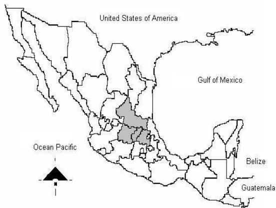
Figure 9. Distribution of Triatoma mexicana in the states of Guanajuato, Hidalgo, Queretaro and San Luis Potosí, Mexico.

This vector has been reported by several authors (Vidal et al 2000, Salazar et al 2007b, Zárate & Zárate 1985, López et al 2005) in an area circumscribed to the center and east of the country (Figure 9). It has been found at an altitude from 1.200 to 1.880 masl (Salazar et al 2007b). Lent & Wygodzinsky (1979) reported a male that measured 25 to 26 mm.