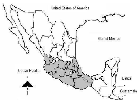
Figure 1. Geographic distribution of Triatoma barberi in the states of Colima, Guanajuato, Guerrero, Hidalgo, Jalisco, Michoacán, Morelos, Oaxaca, Puebla, Querétaro, Tlaxcala and Veracruz, Mexico.

is more effective than T. dimidiata based on entomologic parameters, such as capacity of domiciliation, anthropophilic behavior, time interval between feeding, defecation, and the percentage of infecting forms in feces (Salazar et al 2005b). The natural infection index is variable and depends on the site and number of specimens; it has been reported above 70%.