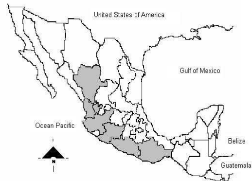
Figure 4. Map of Mexico showing the distribution of Meccus mazzottii in the states of Durango, Guerrero, Jalisco, Michoacán, Nayarit and Oaxaca.

of Jalisco and Nayarit (located in the west of Mexico) (Martínez et al 2008, Martínez et al 2001) without any findings of M. mazzottii in both states.