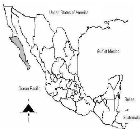
Figure 11. Map of Mexico showing the distribution of Dipetalogaster maxima in the state of Baja California Sur.

This species is located only in the state of Baja California Sur, from the city of La Paz to Los Cabos (Figure 11); this is the largest size vector of Chagas disease, adult females and males can measure 41-42 and 33-35 mm respectively (Lent & Wygodzinsky 1979). Dipetalogaster maxima has a wild life cycle, but it has been observed in the last years to be in a transition and adaptation process to the human housing. We have observed females in sylvatic conditions measuring up to 47 mm, besides this vector has a very large gastric space where it can store large amounts of blood to survive during prolonged fasting periods in semidesertic areas. It has a marked predilection to live amid stones, which has granted it the name of “chinche piedra” (stoned bug). It is collected at an altitude of 0 to 200 masl (Jiménez & Palacios 1999).