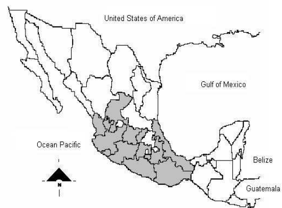
Figure 5. Map of Mexico showing the presence of Meccus pallidipennis in the states of Colima, Estado de México, Guanajuato, Guerrero, Jalisco, Michoacán, Morelos, Nayarit, Oaxaca, Puebla, Querétaro, Veracruz and Zacatecas.

A seroprevalence study performed in 17 communities of this state detected 405 (2.4%) seropositive inhabitants (Coll et al 2004), higher than the percentage reported in a previous study (Velasco et al 1992).