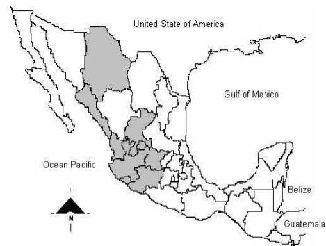
Figure 3. Distribution of Meccus longipennis in the states of Aguascalientes, Colima, Jalisco, Michoacán, Nayarit, Sinaloa, Zacatecas, Chihuahua and Guanajuato. Mexico.

This species is exclusive of Mexico, and is found mainly distributed in the western states of Mexico: Aguascalientes, Colima, Chihuahua, Guanajuato, Jalisco, Michoacán, Nayarit, Sinaloa, and Zacatecas (Figure 3) (Zárate & Zárate 1985) at an altitude from 200 to 1.500 masl (Carcavallo et al 1999). The female measures 30 to 37 mm and the male from 29 to 34 mm (Lent & Wygodzinsky 1979).