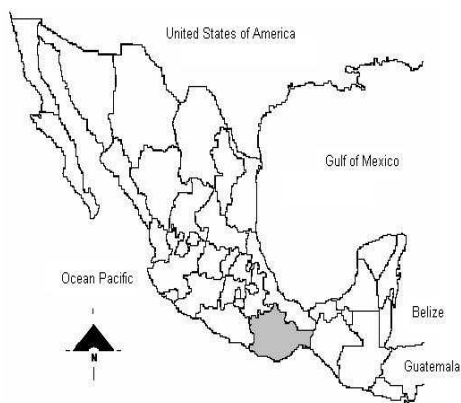
Figure 6. Geographic distribution of Meccus phyllosomus in the state of Oaxaca, Mexico

Even though it has been reported that six specimens of this species have been collected in the peridomicile (Magallón et al 1998), a recent search in the same study area, did not yield any captured specimens (Martínez-Ibarra et al 2008). Vidal et al (2000) in Oaxaca reported 33 specimens, three (9.1%) were positive to T. cruzi . Velasco et al (1991) reported 0.9% of seroprevalence.