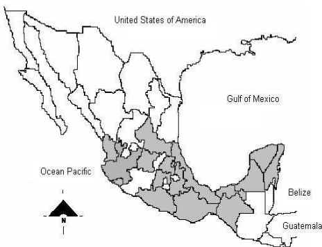
Figure 2. Map of Mexico showing the distribution of Triatoma dimidiata in the states of Campeche, Colima, Chiapas, Estado de Mexico, Guanajuato, Guerrero, Hidalgo, Jalisco, Nayarit, Oaxaca, Puebla, Quintana Roo, San Luis Potosi, Tabasco, Veracruz and Yucatan.

Triatoma dimidiata is to dwell on the floor, particularly beneath the beds and in the angle formed by the floor and the wall (Salazar et al 2005b). It is also attracted by artificial light; it defecates at around 10 to 20 min after eating.