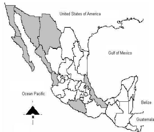
Figure 10. Geographic distribution of Triatoma rubida in the states of Baja California, Baja California Sur, Chihuahua, Guerrero, Nayarit, Sonora, Sinaloa and Veracruz, Mexico.

This vector is reported in the states of Baja California, Baja California Sur, Chihuahua, Guerrero, Nayarit, Sinaloa, Sonora, and Veracruz (Figure 10). It is suggested that its presence in the latter state is due to having been transported by humans from the north. It is found at an altitude of 200 to 1.800 masl. The female measures 19.5-23.0 mm and the male 15.5-20.0 mm (Lent & Wygodzinsky 1979).