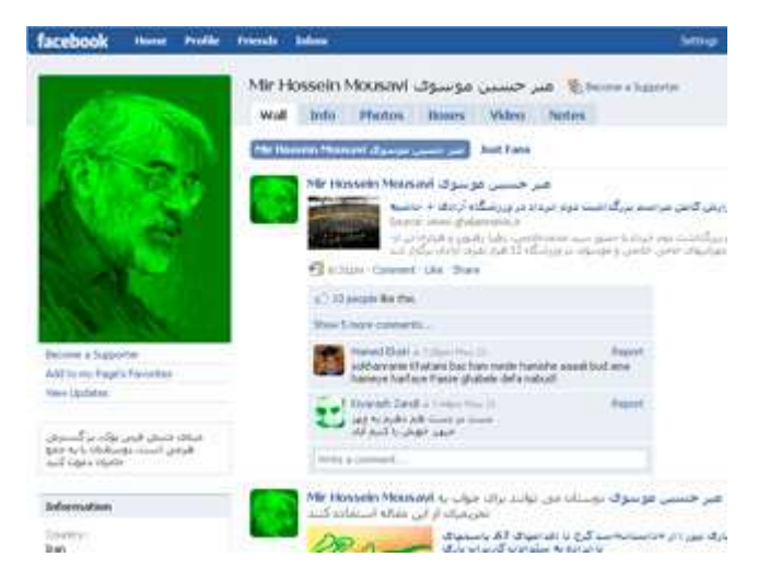
Fig. II – Profile of Mir Hossein Mousavi on Facebook

An example illustrating the importance of the Twitter online social network took place on 15 June 2009, when the possibility of suspending the network for maintenance purposes was advanced. Faced with the concern of Iranians users and followers throughout the world, given that only two days had elapsed since the release of the elections results and the start of protests, those in charge of Twitter opted to defer the procedure<sup>24</sup>. This concern seems plausible when we note that one of the most popular pages on Twitter, with more than 25,631 followers, is about the reformist candidate<sup>25</sup>. Out of curiosity, it must be noted that Mousavi also has a Facebook profile<sup>26</sup> with 3,966 contacts, a YouTube channel<sup>27</sup> with almost 70,000 views, and a Flickr page where he collects pictures of the protests against him<sup>28</sup>.