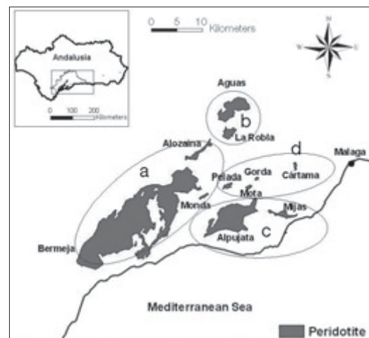
Fig. 2. Location and area of the peridotite outcrops in Malaga: a , Bermeja, 319 km 2 ; b , Aguas, 35 km 2 ; c , Alpujata, 71 km 2 ; d , Guadalhorce, 6 km 2 .

The list of species to be included as serpentinophytes has been created based in several sources. We follow the criteria used by Mota & al. (2008, 2011) to select taxa associated with special substrata, among them, six were applied to establish the serpentinophyte checklist. These criteria were as follows. 1, inductive: species observed on serpentine by our group since 1989 (Cabezudo & al., 1989). 2, expertise: data taken from authors in the specialized literature and our own data that link taxa to serpentine. 3, bibliographical: individual taxa classified as serpentinophytes in the literature. 4, syntaxonomic: presence or absence of serpentinophytes in relevés and in syntaxa detected by others, such as Staehelino-Ulicion baetici , which are linked exclusively to serpentine. In addition, the 5