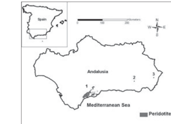
Fig. 1. Peridotite outcrops in Southern Iberian Peninsula (Andalusia, Spain): 1 , Ronda Mountain ranges (Malaga); 2 , Sierra Nevada (Almeria); 3 , Lubrín (Almeria). Serpentinophytes are restricted to the outcrops of Malaga.

The main peridotite outcrops in the south of the Iberian Peninsula (Fig. 1) are located in the province of Malaga (Ronda Mountain Range; Fig. 2). The mineralogical composition is characterized by harzburgite, lherzolite, piroxenite and serpentinite. They can be grouped them into four geographical units (Fig. 2): 1, Sierra Bermeja: the most important outcrop, covering 319 km 2 with an altitude range of between 50 and