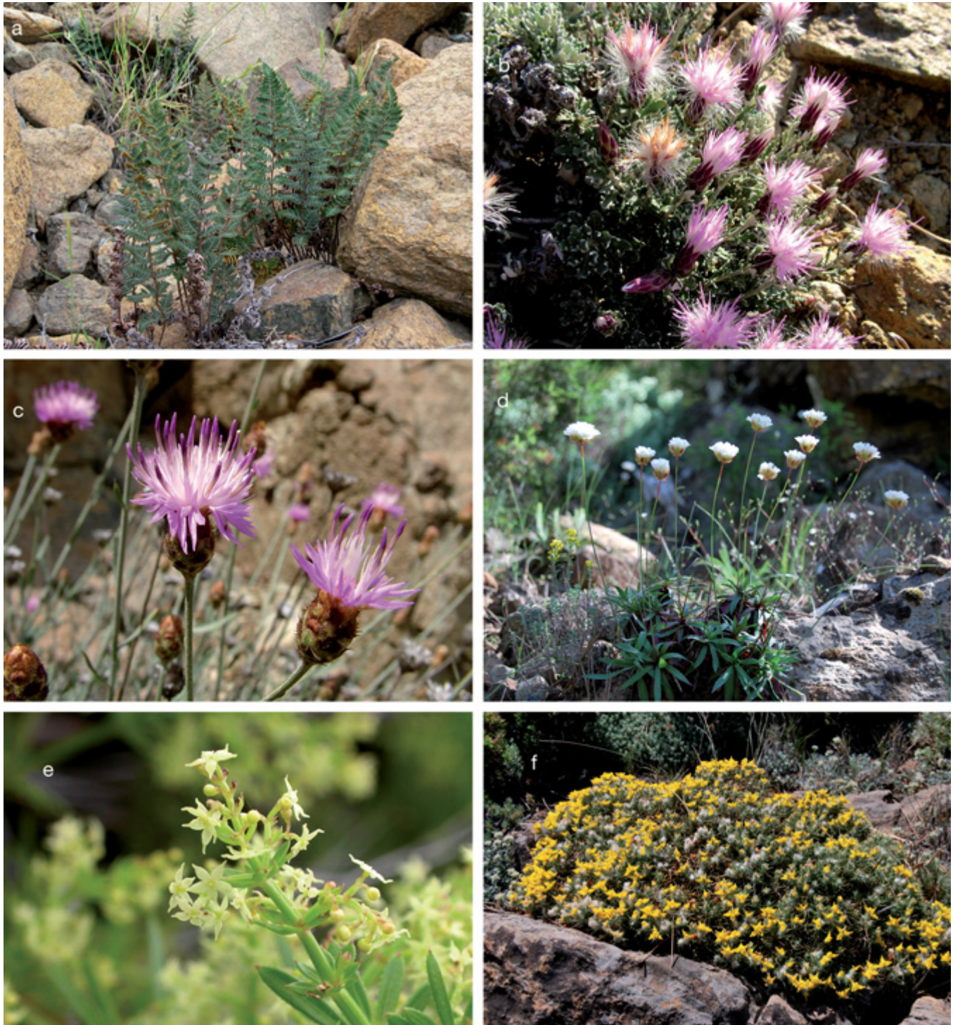
Fig. 4. Some selected South-Iberian serpentinophytes. Obligate serpentinophytes: a , Notholaena marantae (Sinopteridaceae); b , Staehelina baetica (Asteraceae); c , Centaurea carratracensis (Asteraceae); d , Armeria colorata (Plumbaginaceae). Preferential serpentinophytes: e , Galium viridiflorum (Rubiaceae). Subserpentinophytes: f , Genista hirsuta subsp. lanuginosa (Fabaceae).

grasslands, hydrophilic vegetation and riverine forests. ( Galio viridiflori-Schoenetum nigricantis , Molinio-Ericetum erigenae , Erico-Nerietum oleandri , Erico-Salicetum pedicellatae ). Local endemism. Bermeja, Alpujata and Aguas. V-VII (VIII). VU (Spanish and Andalusian red lists and Andalusian legisla-