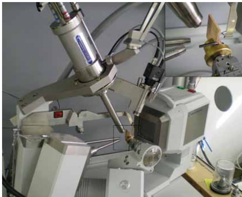
Figure 1. X-ray diffractometer device used for measuring XRD patterns. Top right: detail of the specimen holder and the CuK \alpha radiation gun.

A single X-ray diffraction pattern was recorded on each sample. The estimated error of the repeatability of the T parameter measurements was 3%, on average, for T ranging from 14^\circ to 29^\circ which correspond to \pm 0.6 degrees.