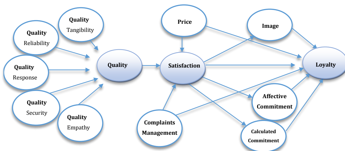
Figure 1 - Conceptual Model