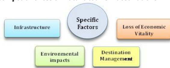
Figure 1 - Specific factors that influence the competitiveness of mature tourism destinations

On the basis of our extensive review of the literature that states explicitly that the destination in question is at the maturity stage, as well as on the research conducted by Wilde and Cox (2008), we can conclude that there are specific factors that may adversely affect the competitiveness of mature tourism destinations. This includes the lack of maintenance and modernisation of the existing infrastructure, difficulty in creating a shared vision as to how the destination should develop, difficulty in getting the different stakeholders to cooperate, the loss of the destinations' economic vitality and, finally, social, cultural and environmental impacts on the destinations as a result of their involvement in tourism over the years (Figure 1).