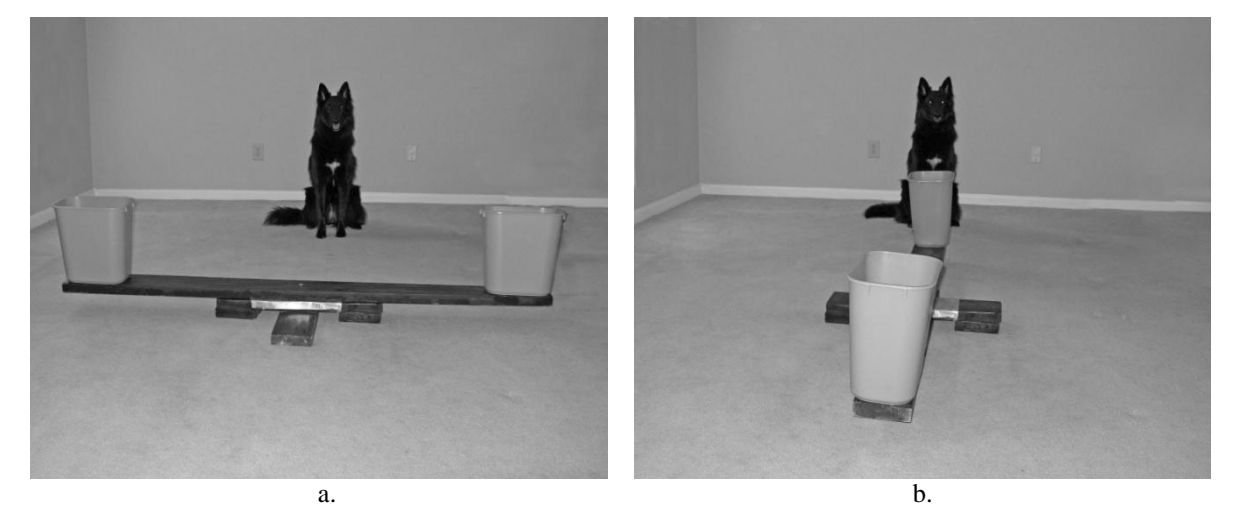
Figure 1 . Apparatus and dog in the starting position for the visible displacement test (a). Apparatus and dog in the starting position for the 90^{\circ} invisible displacement test (b).

The version of invisible displacement selected was a rotation task. Here a food object is visibly displaced in one of two identical containers mounted on the ends of a rotating beam that is initially placed parallel to the dog (see Figure 1b). Following visible displacement, rotating the beam of the apparatus 90° to the left or right, so that the beam is perpendicular to the dog and the containers equidistant (see Figure 1a), invisibly displaces the hidden object. It is believed that dogs need to 'infer' the new location of the object in order to search accurately (Miller, Gipson, Vaughan, Rayburn-Reeves, & Zentall, 2009). Previous research has observed that dogs can succeed on this task, and control conditions have evidenced that they do so by using a visual memory (Miller et al., 2009). In general, search accuracy by dogs is rather high. Nonetheless, error rate increases when delays are interpolated by drawing a curtain (opaque cloth) between the dog and the apparatus following invisible displacement (Miller, Rayburn-Reeves, & Zentall, 2009). When delays are interpolated between the displacement and the search, large individual differences emerge suggesting that dogs have differing capacities for remembering the hidden object location of the over time.