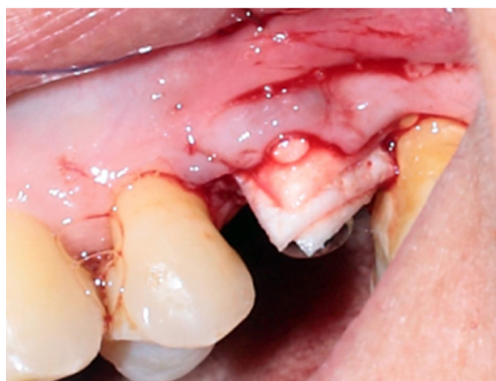
Figure 2. Placement of the collagen matrix in partial thickness flap elevation.