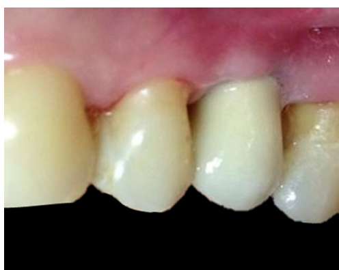
Figure 3. Complete prosthetic restoration. The peri-implant biotype has thickened.