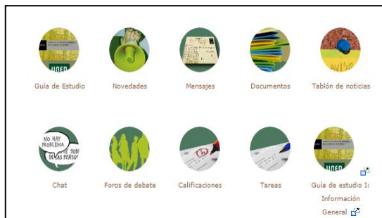
Figure 1. aLF Learning environment

aLF structure is based on the following functionalities: forums, news, chat, bulletin board, messages, study guides, documents, activities, scores and assessments (Figure 1).