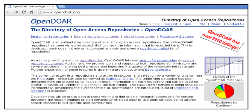
Fig. 1. Home of Directory of Open Access Repositories