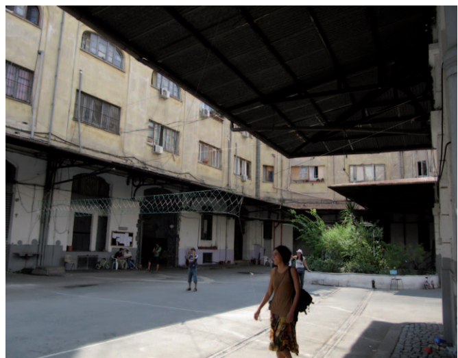
Figure 2: Porto Fluviale, the courtyard. DPU summerLab, 2012.