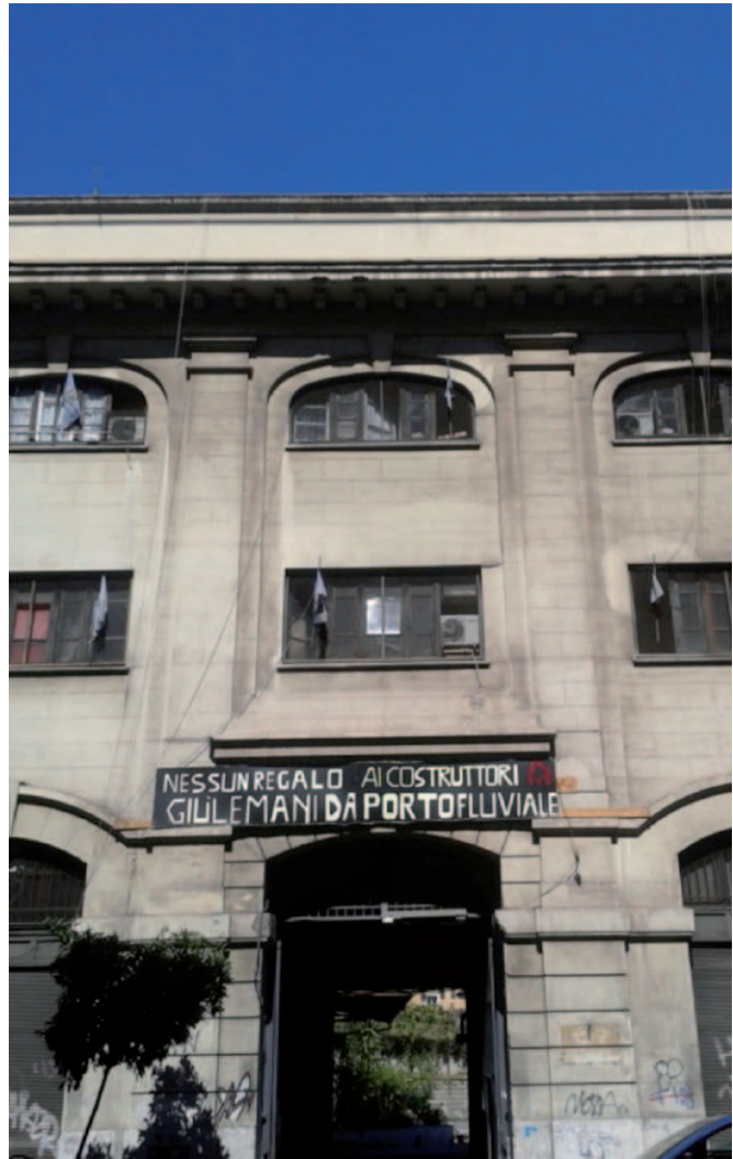
Figure 1: Porto Fluviale, the outside.