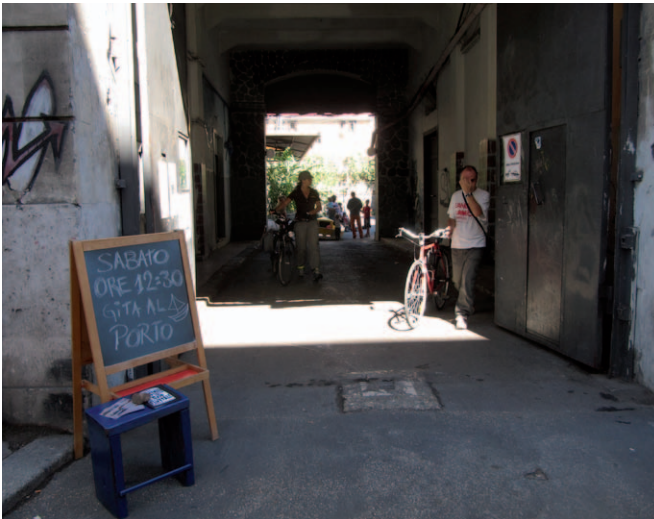
Figure 3: Porto Fluviale, the open gate on the final day of workshop. Source: DPU summerLab, 2012.