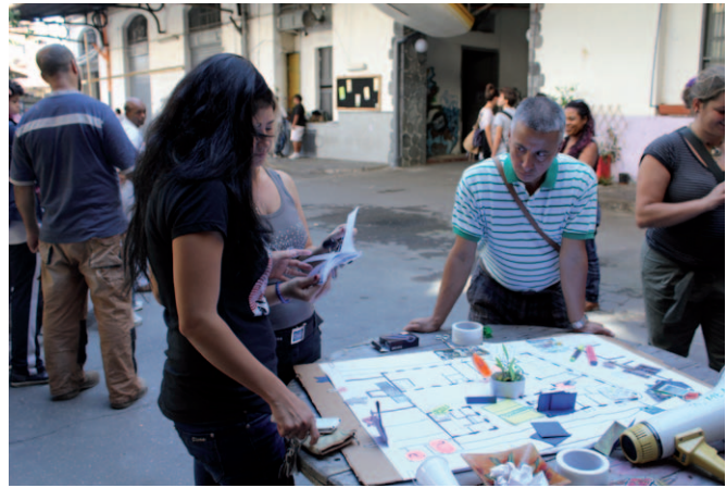
Figure 6: Porto Fluviale, a moment of our workshop, discussing possibilities with the inhabitants.