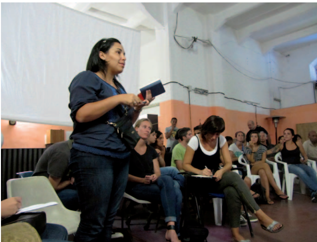
Figure 5: Porto Fluviale, the assembly.