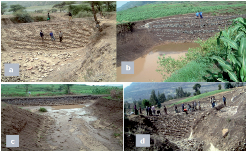
Figure 2. Examples of SSDs constructed in the Amhara region, Ethiopia (a) Delanta, (b) Kobo, (c) Bati and (d) Kutaber (Photos by Mulatie Mekonnen).

To find multi-year data, SSDs with different ages (2-8 years old) in sub-catchments with different soil types, rainfall amounts and elevations were selected for this study. The amount of sediment trapped and stored behind each SSD was measured based on the geometric nature of the drainage channels, SSD dimensions and the surface area of the sediment using GPS and measuring tape. Some of the structures have trapezoidal shapes and others have rectangular shapes (see examples in Fig. 2).