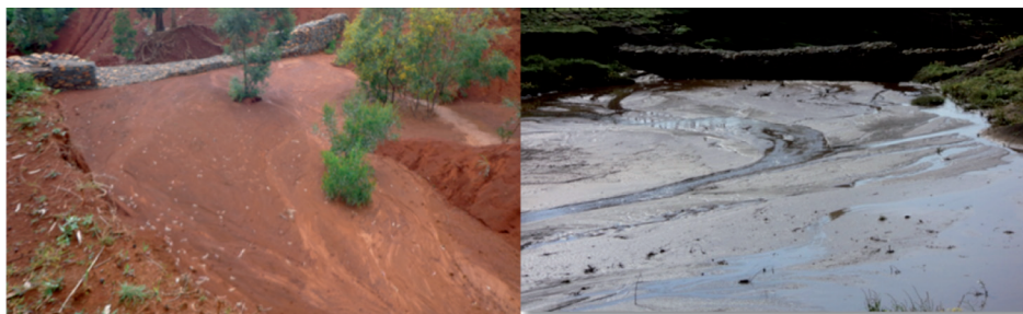
Figure 3. Example SSDs and trapped sediment at Segno Gebeya (left) and Enchet Kab (right).

Sediment bulk density values ranged from 1.33 g cm -3 in heavy clay sediment deposits to 1.53 g cm -3 in sandy loam dominated sediments. On average SSDs trapped about 1584 t of sediment annually. Fig. 3 illustrates part of the sediment trapped and deposited behind the SSDs. Table 3 shows calculated annual sediment yield (SY) and area specific sediment yield (SSY) for all sub-catchments. SY and SSY show large variation between sub-catchments, ranging from 297-5759 t and 8.6-55 t ha -1 yr -1 , respectively.