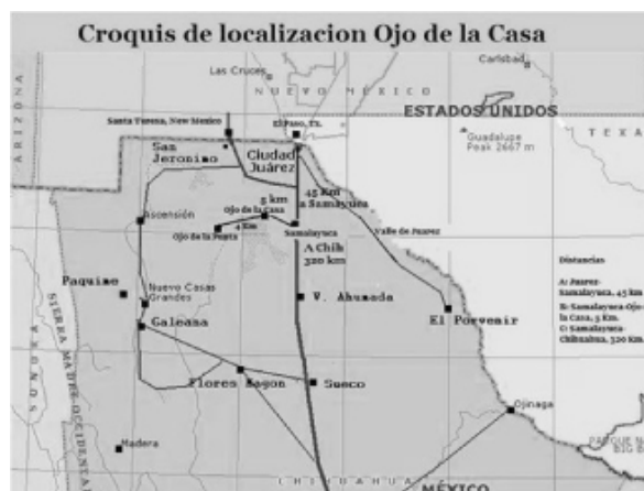
Figure 3. Ojos de Agua Locations

560 x 459 | 129.1 KB