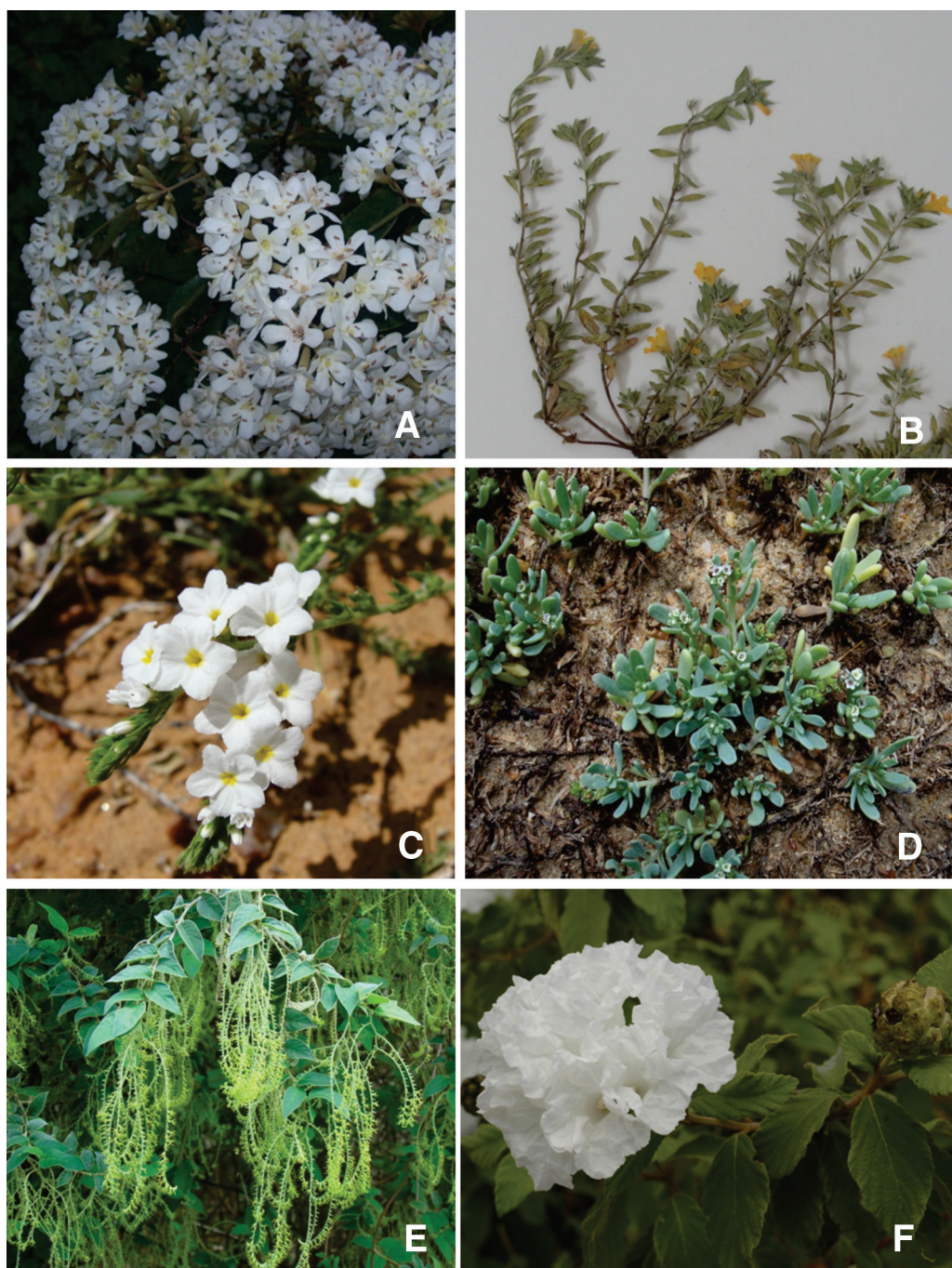
Fig. 2. Boraginaceae species of the study area, lower-mid and lower São Francisco River, Pernambuco and Bahia states, Northeast Brazil. A , Cordia trichotoma : inflorescence; B , Euploca paradoxa : habit; C , E. ternata : reproductive branch; D , Heliotropium curassavicum : habit; E , Myriopus salzmannii : habit; F , Varronia leucocephala : reproductive branch, showing flowers and immature fruits.

do Norte (Taroda, 1984) and Alagoas and Sergipe (Melo & Sales, 2005).