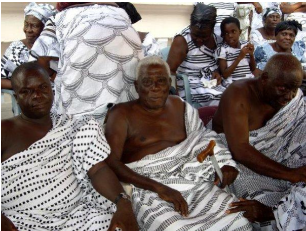
Figure 1. Picture from a family reunion, shared online