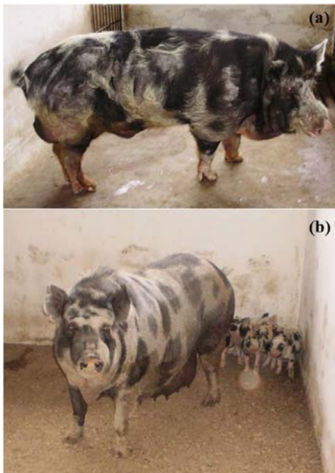
Figure 1. Piau boar (a) and Piau lactating sow (b). (Macho Piau (a) e fêmea lactante Piau (b)).

In 1998, five males and five females of the local Piau breed were introduced to the Pig Breeding Farm at the Federal University of Viçosa, Minas Gerais state, Brazil, for conservation and genetic research. Over 10 years, populations of approximately 20 females and 5 males were kept for reproduction in each generation. The herd was kept closed until 2008, when two boars from Empresa Baiana de Desenvolvimento Agrícola (EBDA) were introduced into the population. Since the introduction of the