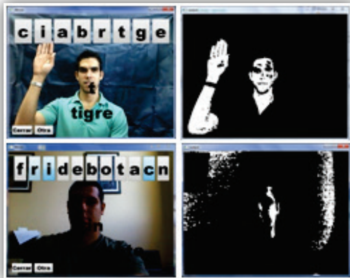
Figure 2. Skin Detection under different conditions.