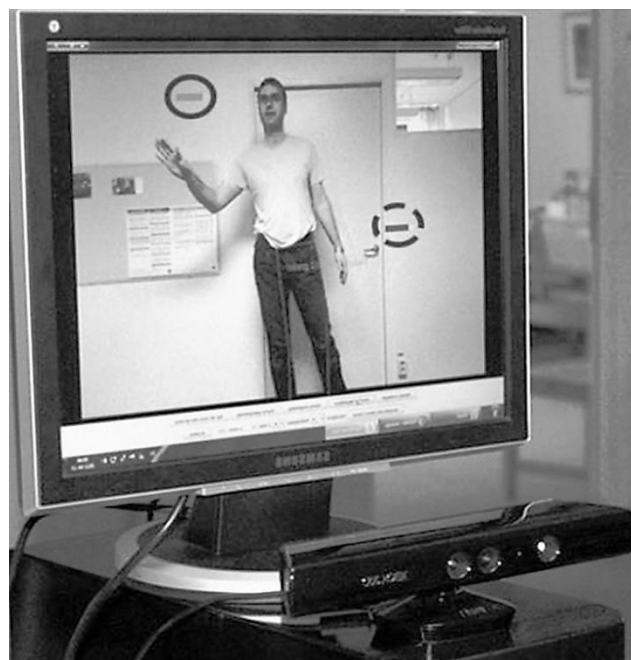
Figure 1. A screenshot from the player's perspective, in the upper right corner reaching for a red box (black circle) and at the bottom left corner a blue box (dotted circle) flies in.