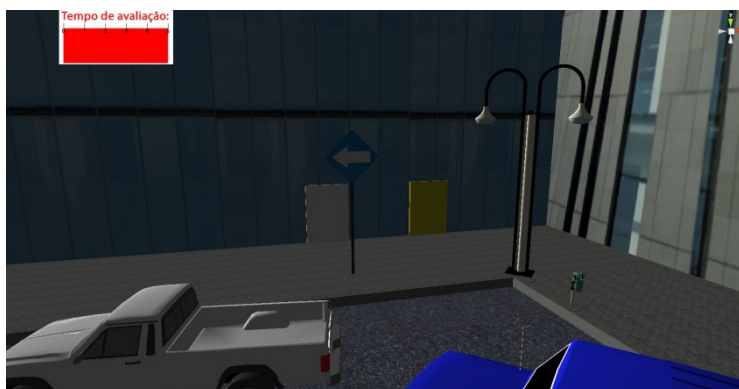
Figure 4. The doors where the patient must enter to change the level of stimulation

A pipeline of the system use is presented in Figure 5.