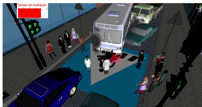
Figure 2: An example of a scene of an accident: a person was hit by a bus

The scale used to measure the patient level of anxiety is the SUDS - Subjective Units of Disturbance Scale that assesses the degree of anxiety during the trauma stimulation. The SUDS is a range of integer values