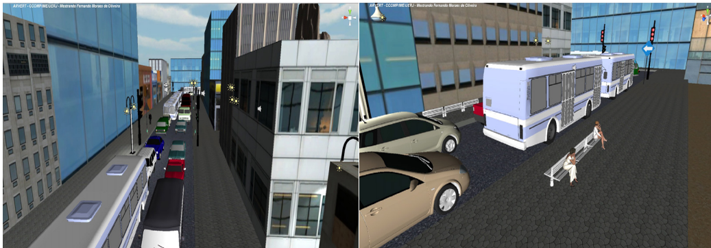
Figure 1: The ARVET environment: general scenes views

The exposure to virtual environments can generate reactions and perceptions, which are difficult to be assessed jointly by the therapist. Aiming to integrate these data and classify the patient in real time during the VRET process, we developed an application that explores the techniques of Fuzzy Logic - the SAPTEPT - System of the Evaluation of the Patients with Posttraumatic Stress Disorder.