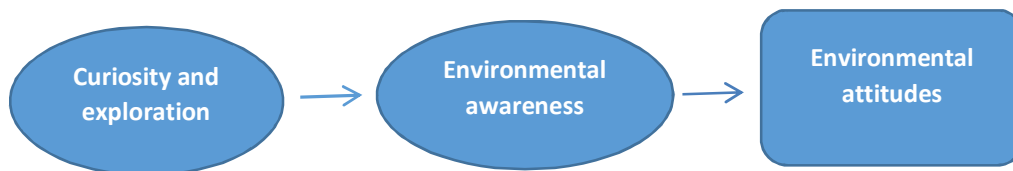
Figure 1. Estimated structural equation model