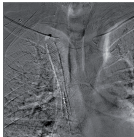
Fig. 2. Stent implantation in the superior vena cava.