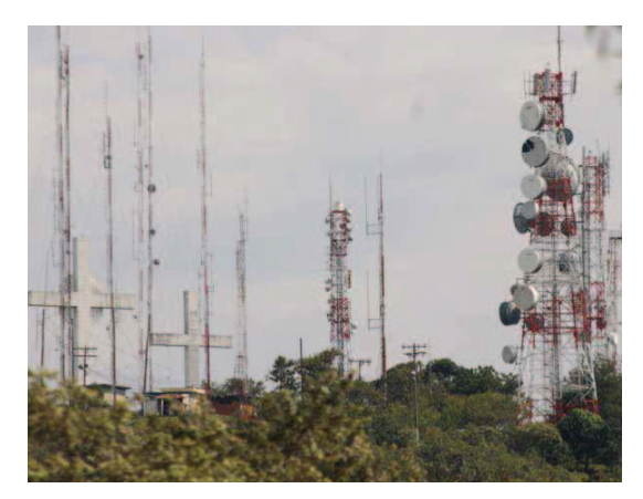
Fig. 3. Visual pollution caused by telecommunications infrastructure.

In addition to the possible effects on health by NIR causing community fears, the damage to the environment is also found and it is caused by the visual pollution as illustrated in Fig. 3. Given this situation, municipalities create barriers in their development plans, to the proper deployment of infrastructure to ensure quality standards required by users.