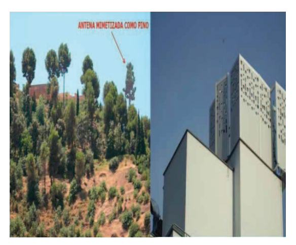
Fig. 4. Mimicry in rural and urban areas [22].

Uninstalling or relocation infrastructure is not necessary to counter the visual pollution; there are mechanisms of mimicry that can significantly reduce the environmental pollution, caused by the disorderly unwinding of this infrastructure [21]. Fig. 4 illustrates examples of infrastructure mimicry in both rural and urban areas.