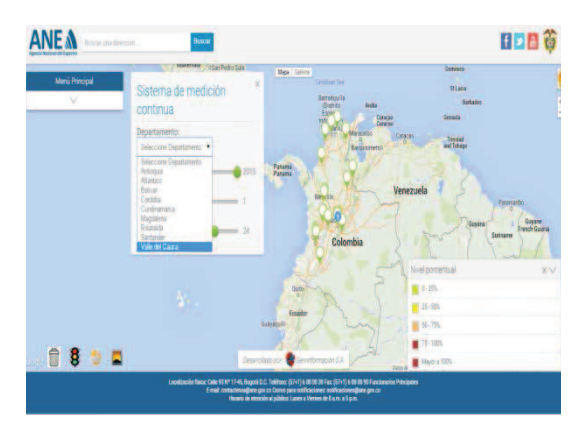
Fig. 5. Monitoring system in Colombia NSA [11].

The need to create a regulatory development that includes the following criteria is evident: