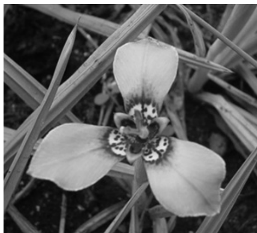
Figure 2. A Herbertia lahue subsp. lahue ("lahue") plant in its natural habitat, showing both foliage and flower.

The present study had the objective of studying the effect of bulb weight of H. lahue subsp. lahue on blooming capacity, flower quality and vegetative reproduction.