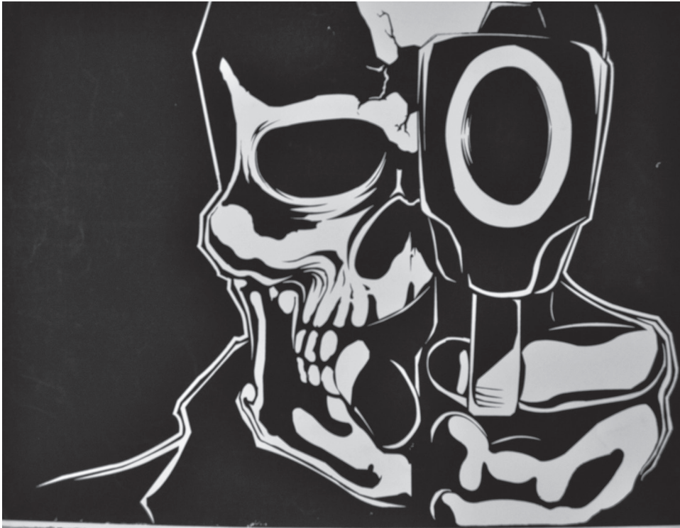
PHOTOGRAPH 1. “El Sicario” (The Hit Man)