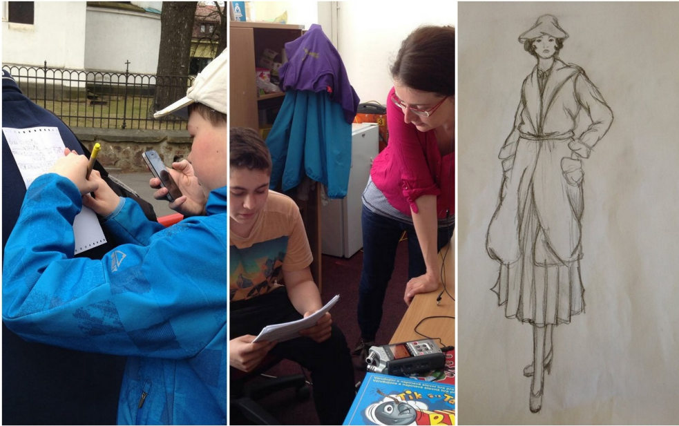
Figure 1. Students' work - locations spotting, recording session and illustrations One teacher from the Edvard Beneš elementary school controlled students' activities between the workshops, motivated them for further activities, supplied them by additional historical sources and supported them through individual consultations

The NGO provided students by final application and implemented students-made content. In the end the 'designers' organized the public release where other students played the game on the school' or their own mobile devices (the game is freely available on Google Play store). The outreach event was a success and was enjoyed by both the community attendees and student participants.